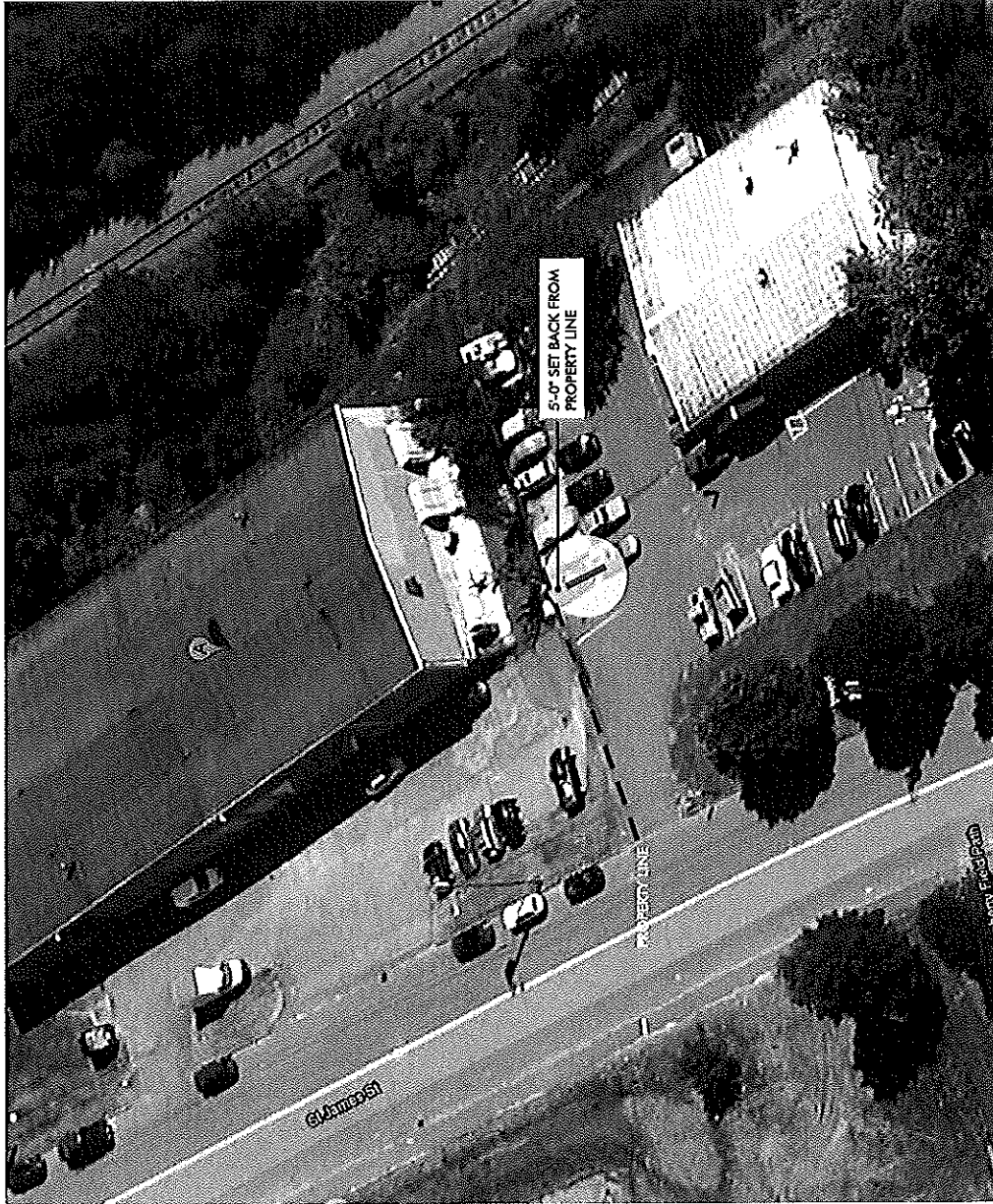
SIGN LOCATION PLAN NOT TO SCALE

Neokraft Signs, Inc. 486 York Street Lewiston, Maine 04240 Tel: 207.762.9154 Fax: 207.762.9099 1.800.337.2258 © COPYRIGHT 2012, BY NEOKRAFT SIGNS, INC.