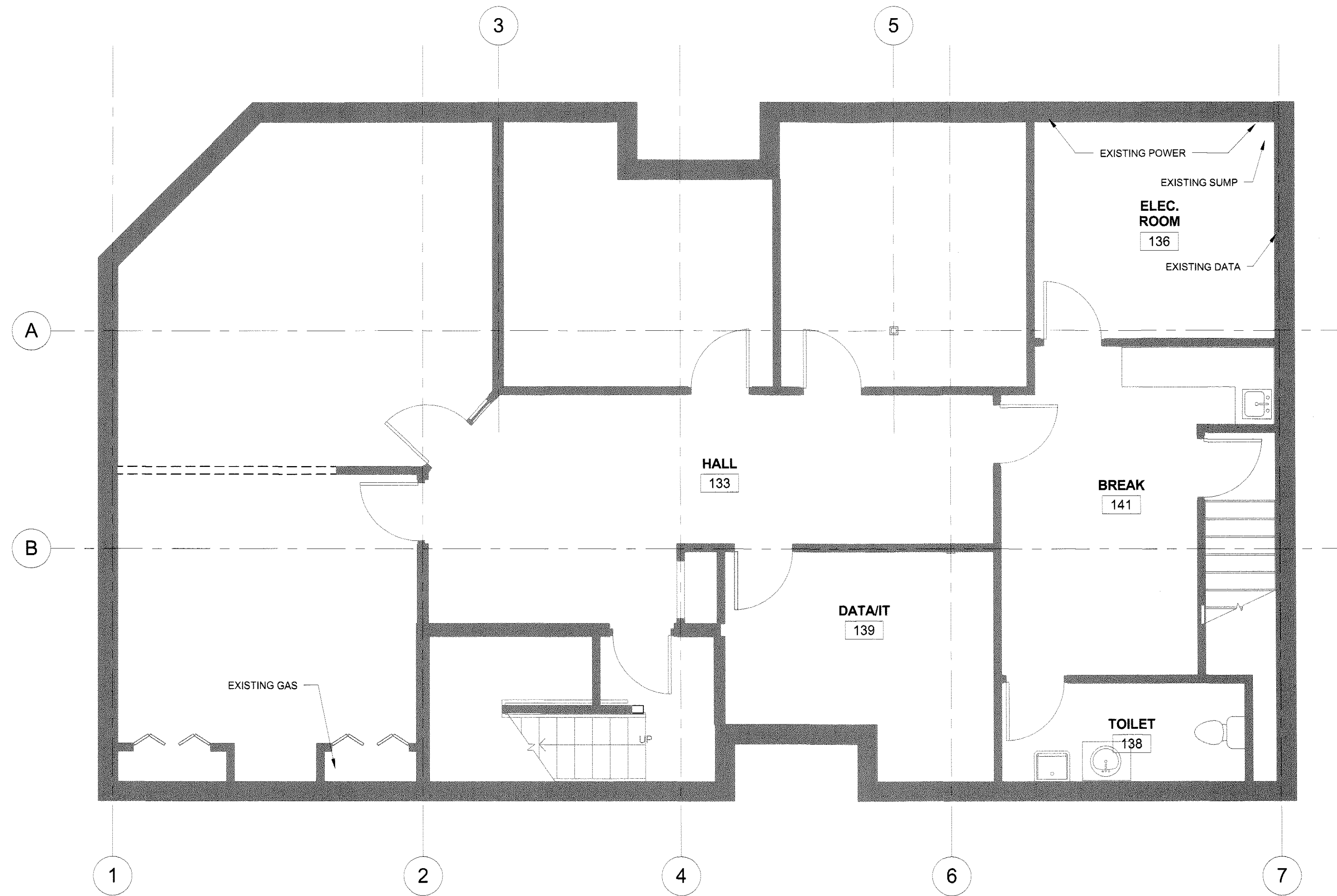
A3 BASEMENT DEMO PLAN 1/4" = 1'-0"