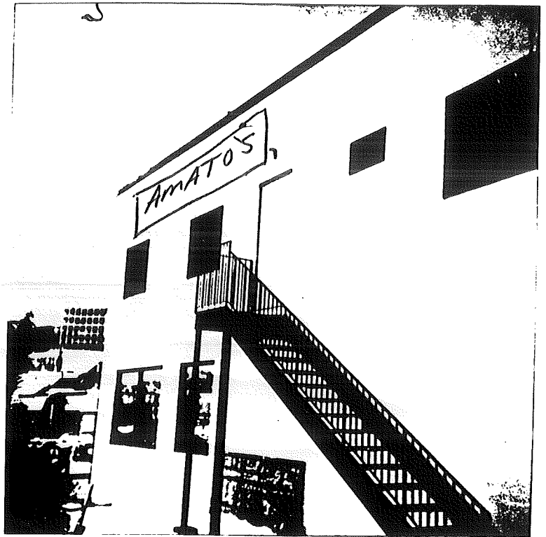
placement of sign

Note! This is on the right side of the Bldg AS viewed from the front of Bldg