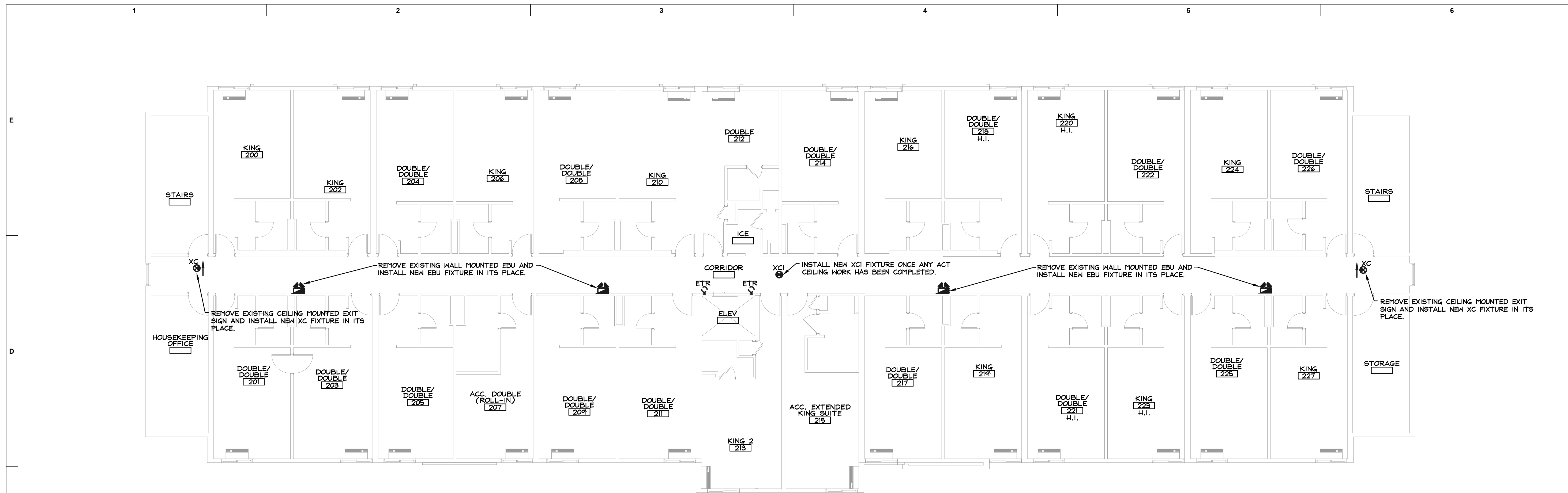
SECOND FLOOR LIGHTING PLAN 1/8" = 1'-0"