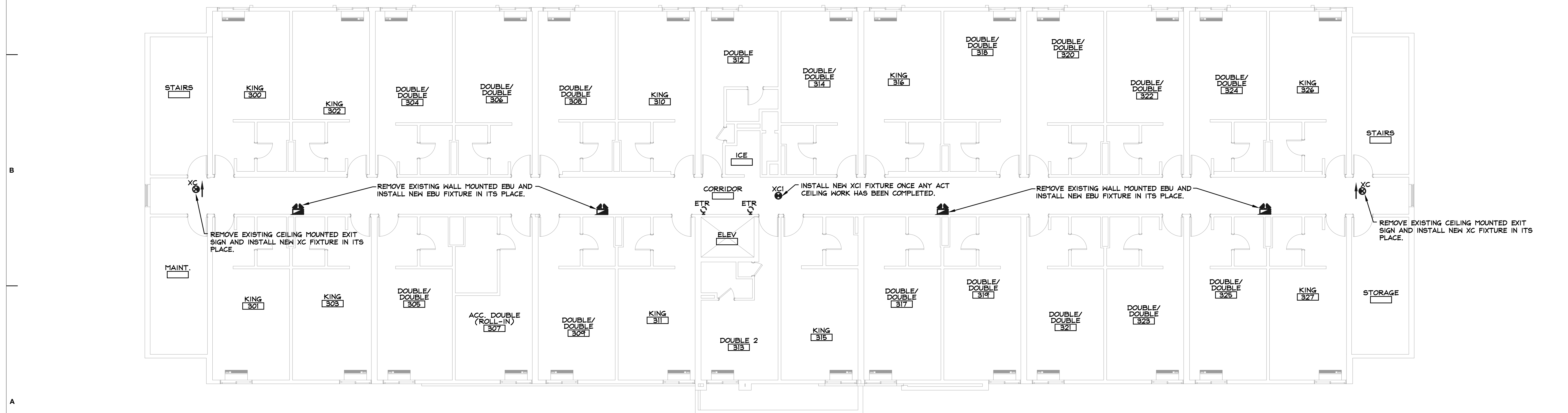
THIRD FLOOR LIGHTING PLAN 1/8" = 1'-0"