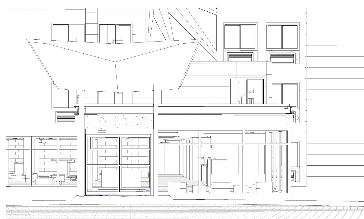
LOBBY ENTRY VIEW