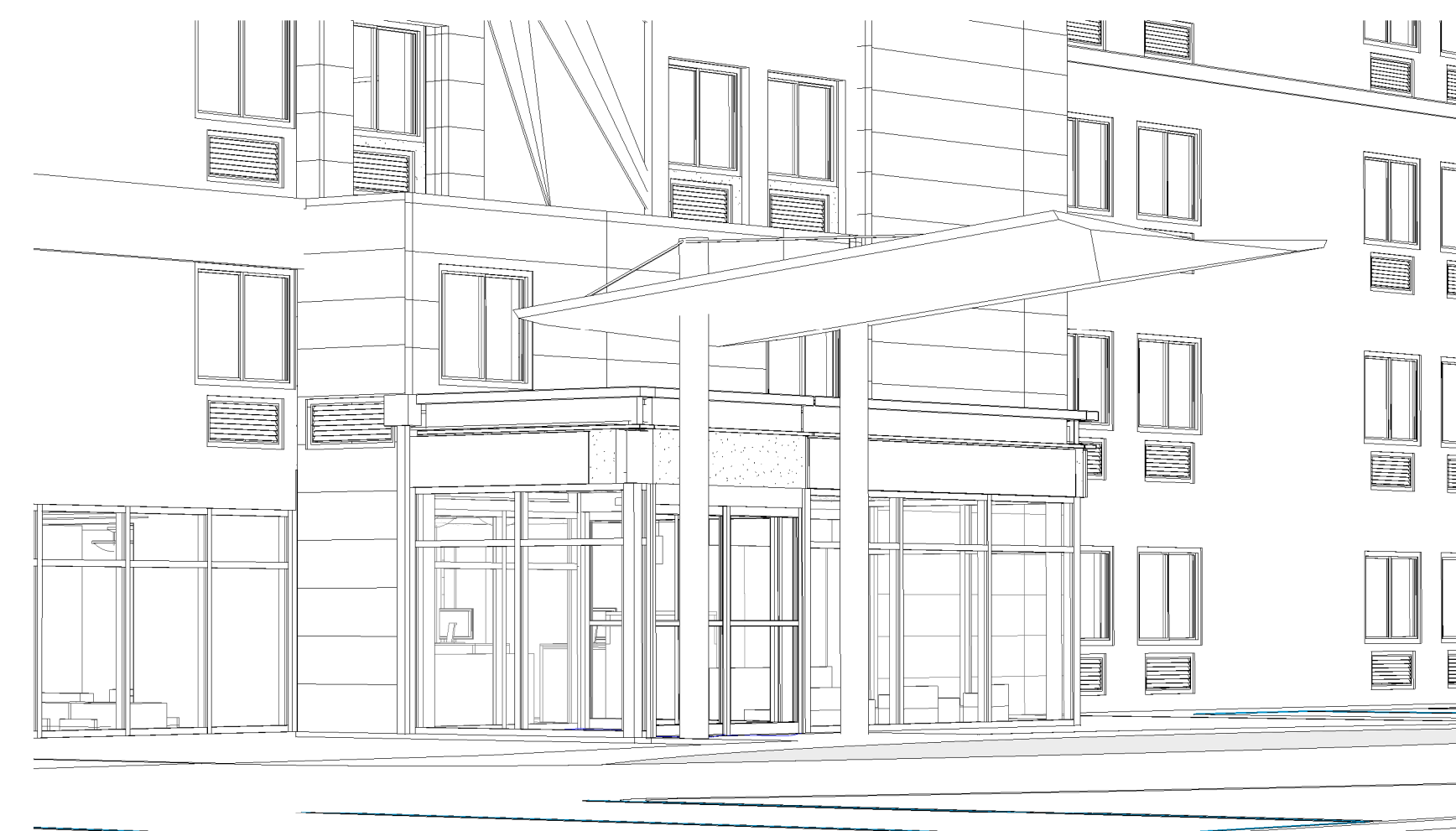
LOBBY VIEW LEFT