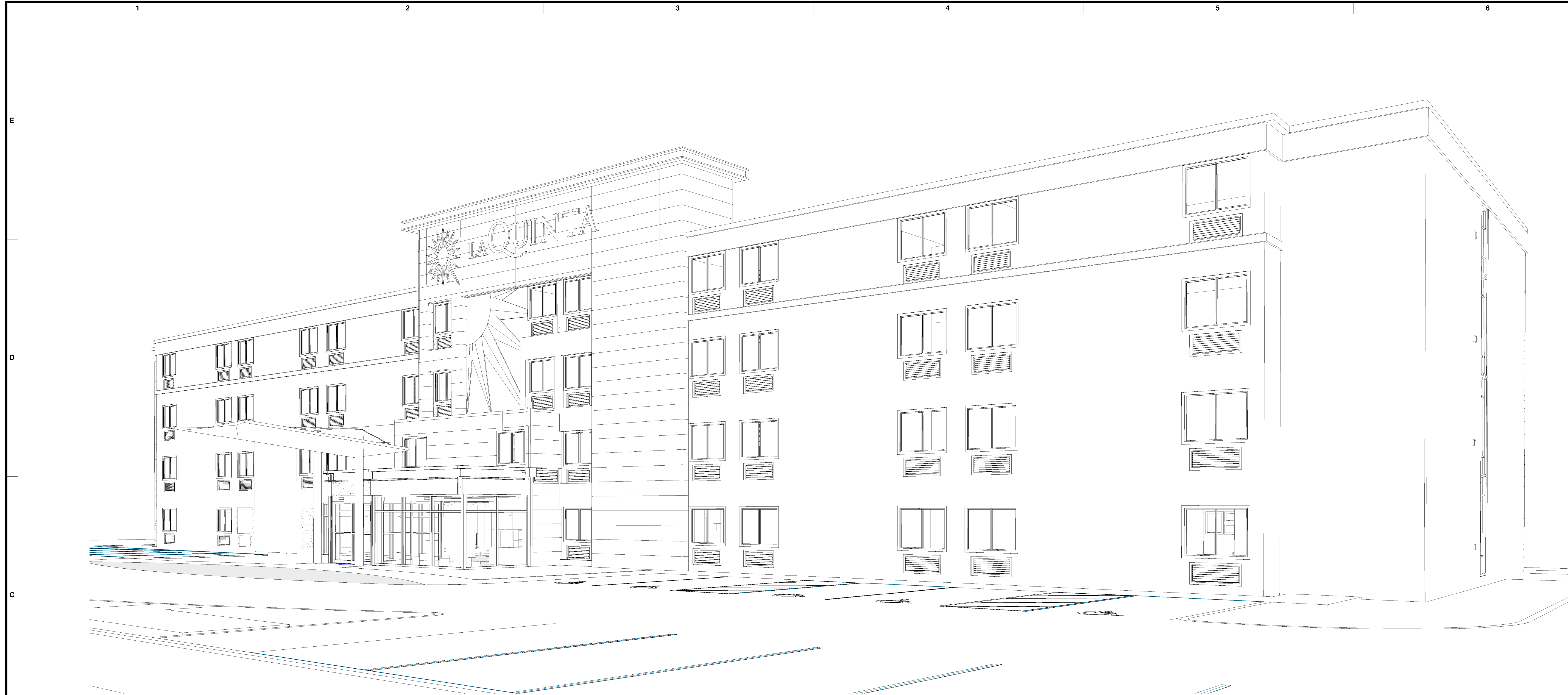
OVERALL PERSPECTIVE VIEW