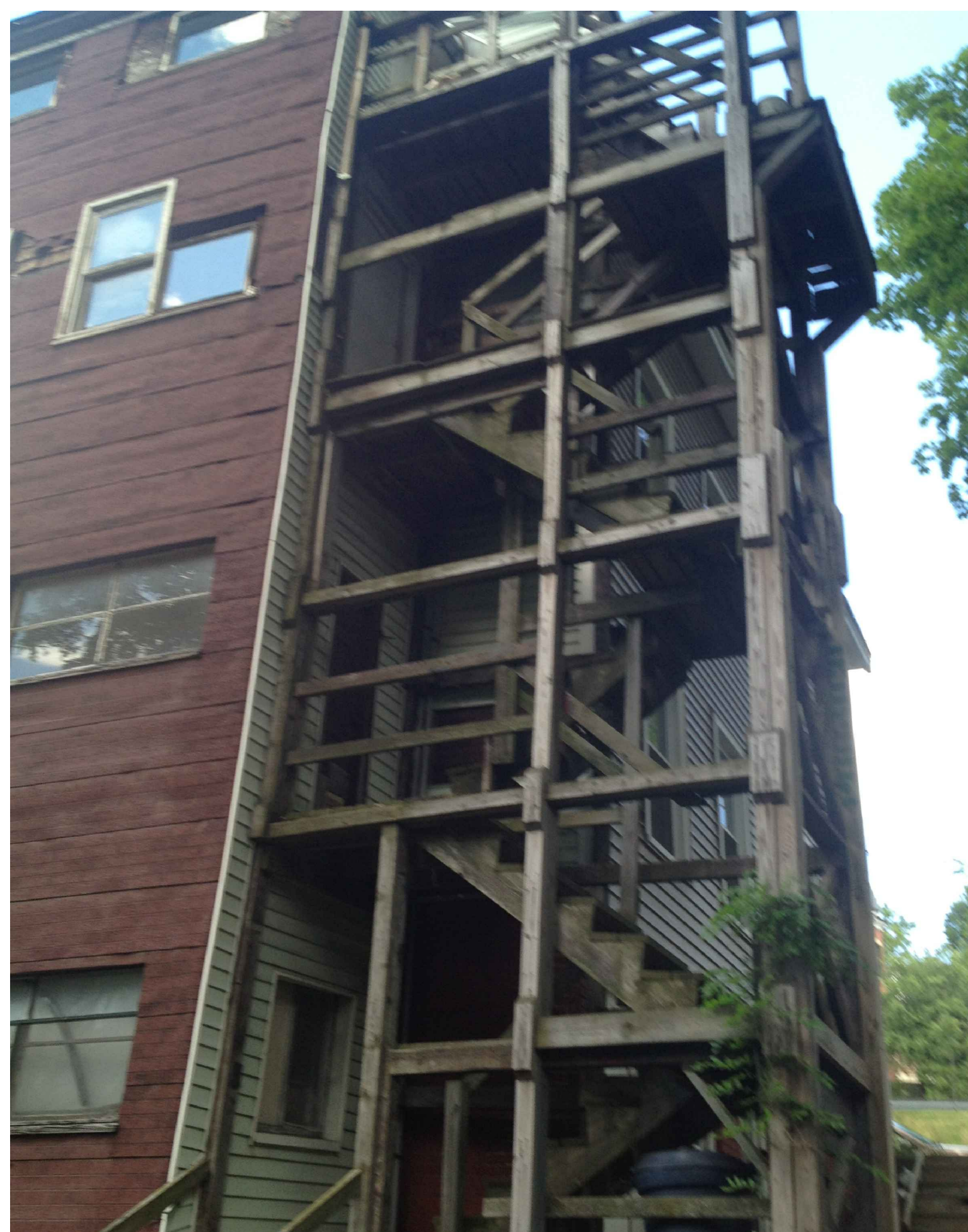
EXTERIOR STAIR TO BE REMOVED N.T.S.