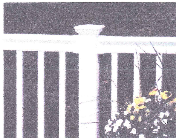
Oxford with square balusters in white