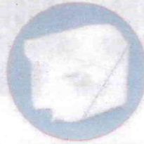
stair (field alteration)