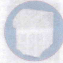
column (minimum 8" round)