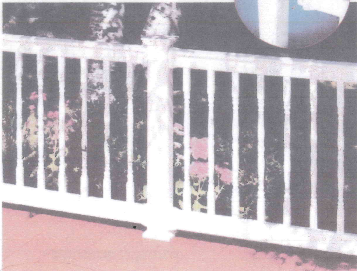
Oxford in white with colonial balusters