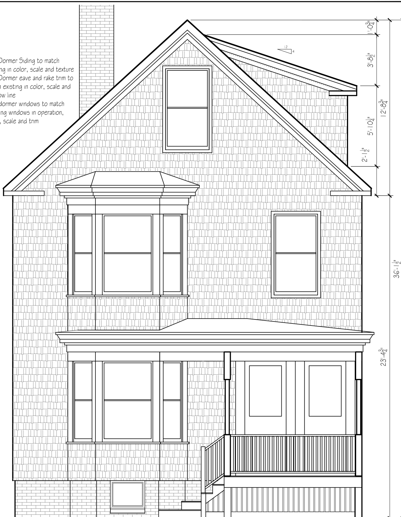
Street Elevation Revised