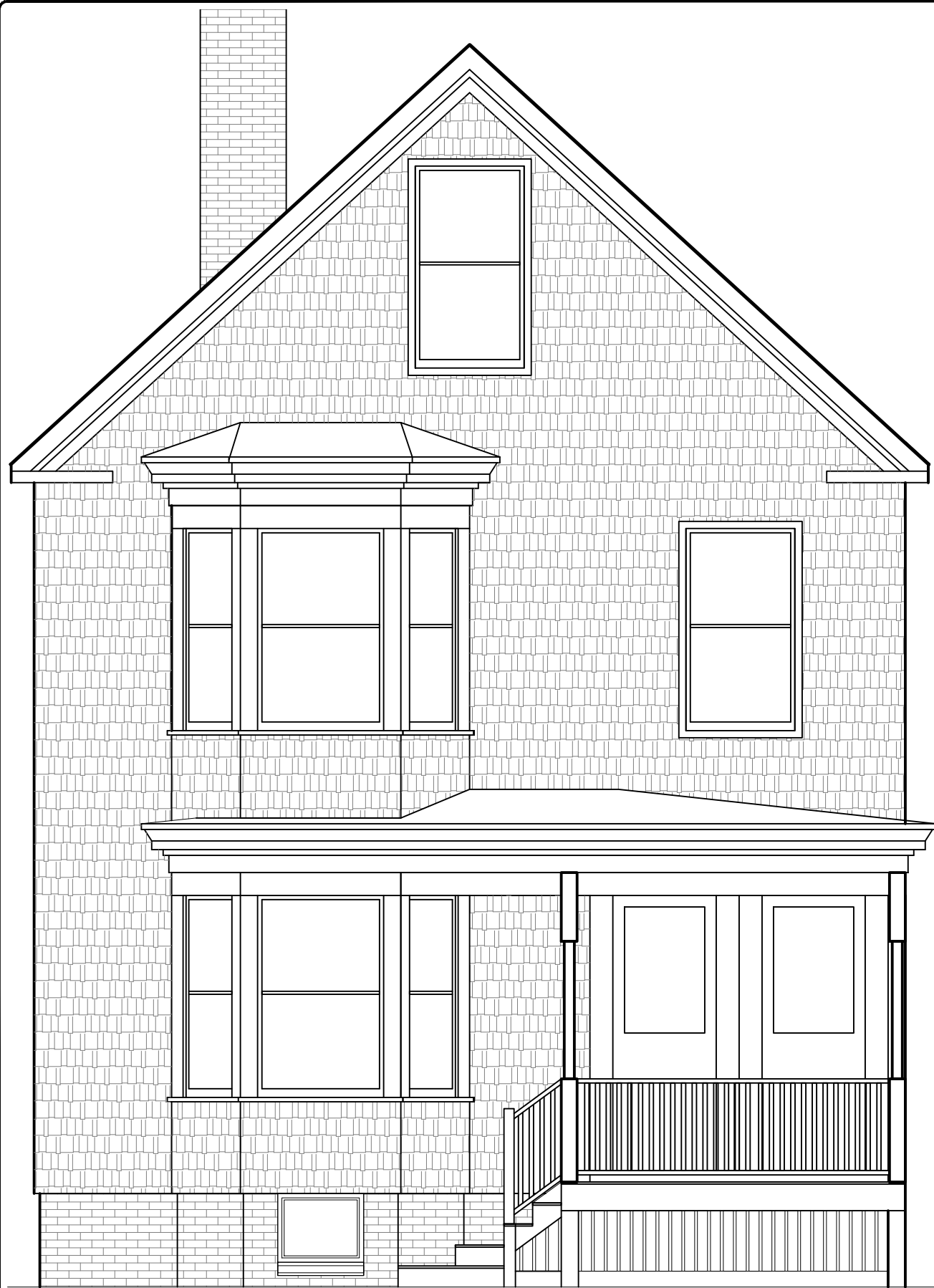
Street Elevation Existing