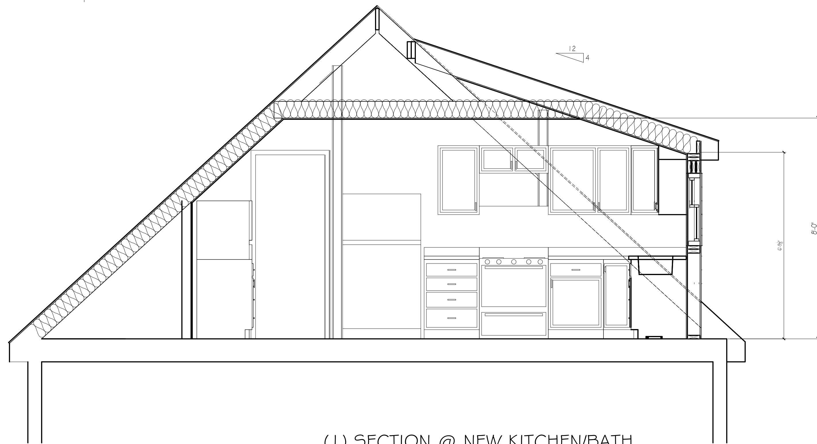
(1) SECTION @ NEW KITCHEN/BATH SCALE: 1/2" = 1'-0"