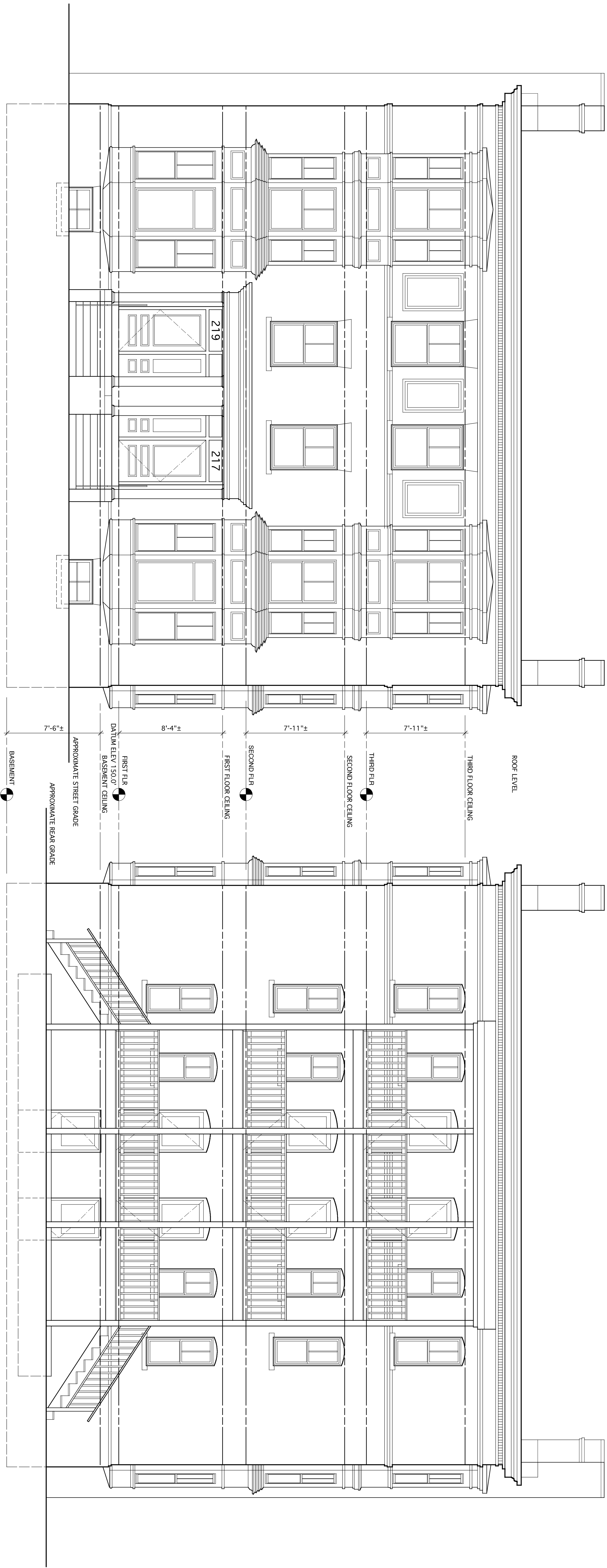
2 EAST ELEVATION - REAR A2.3 Scale: 1/4" = 1'-0"