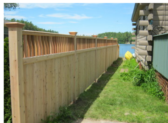
6' Board Fence with 2' Finial and a Scallop 6' to 4' Sloped Section at Street