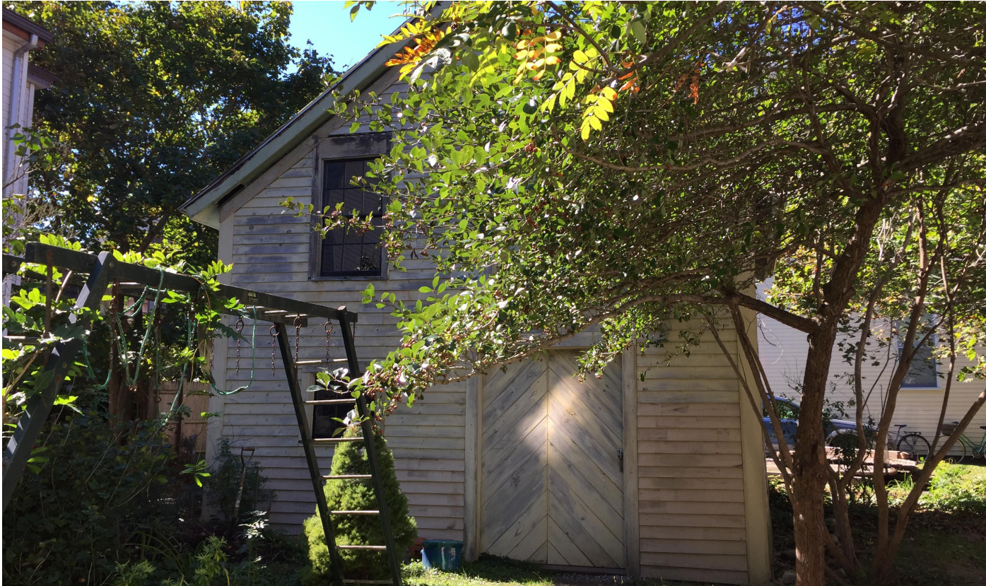
Front of barn