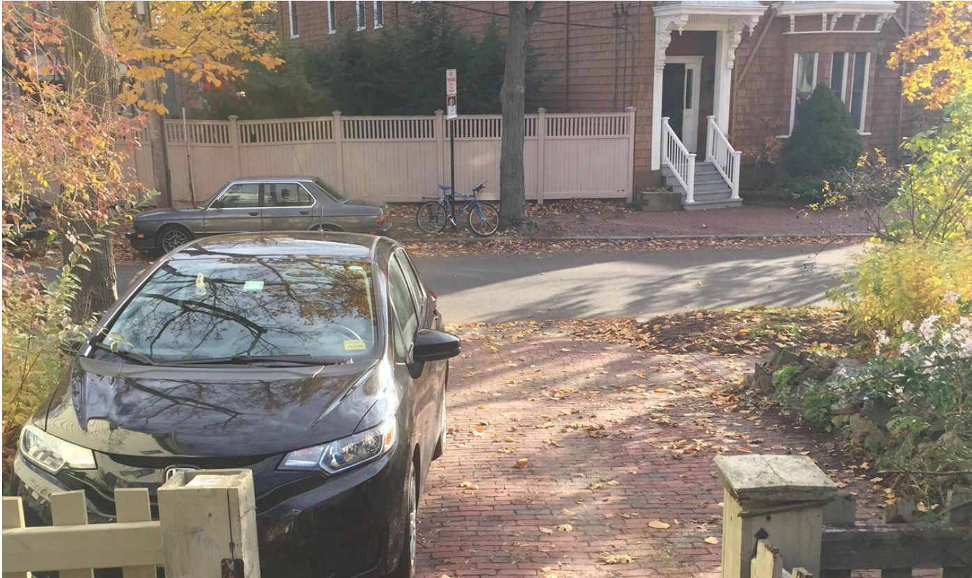
From top of drive