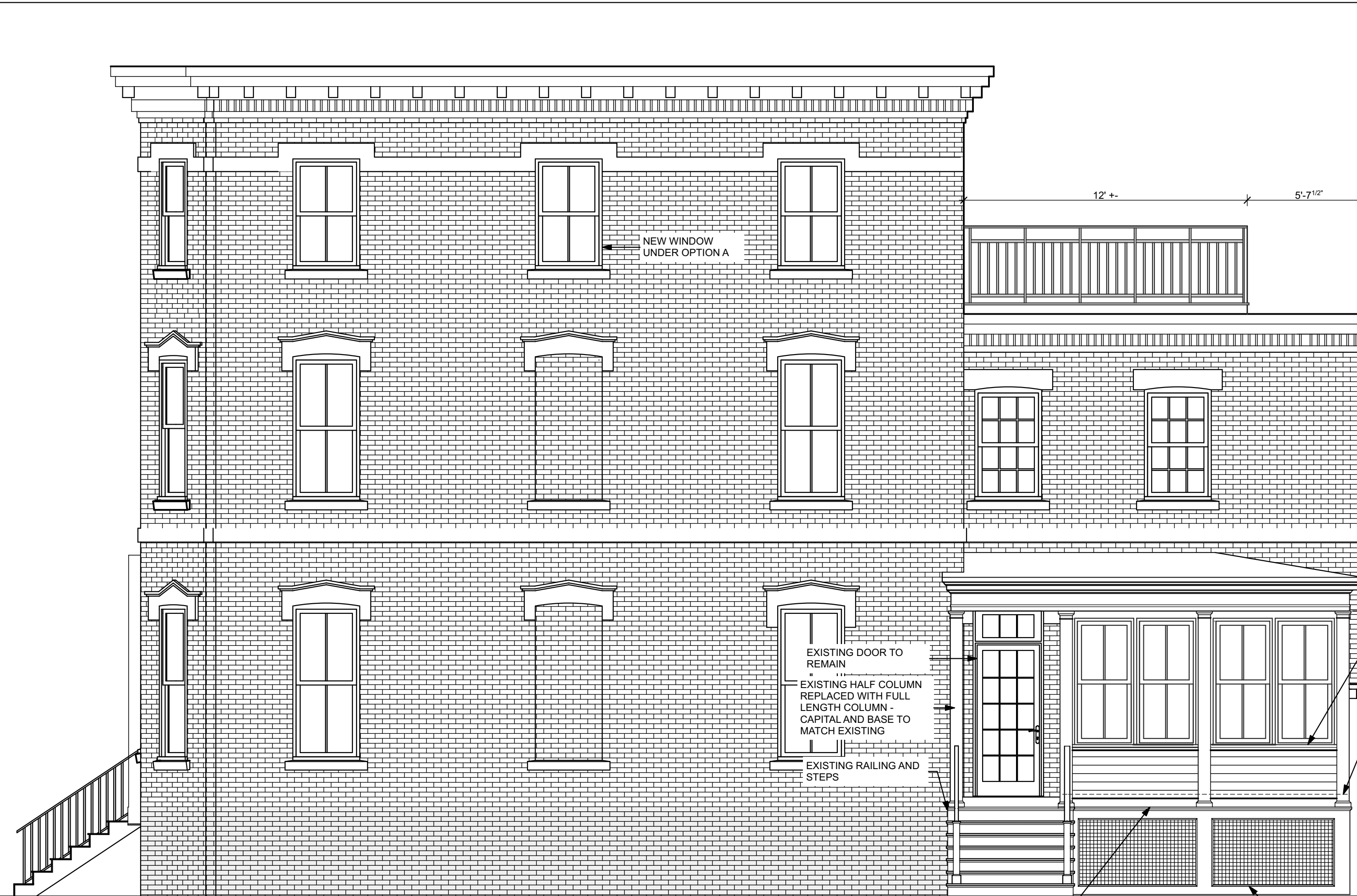
2 A4 EAST ELEVATION SCALE: 1/4" = 1'-0"