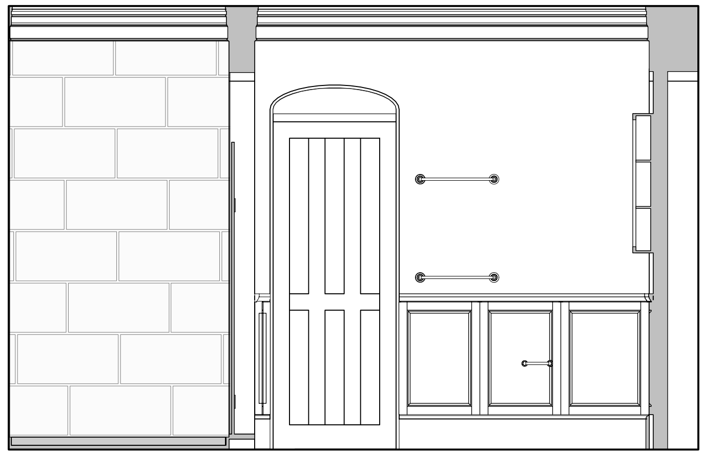
4 BATH ELEVATION Scale: 1/2" = 1'-0"