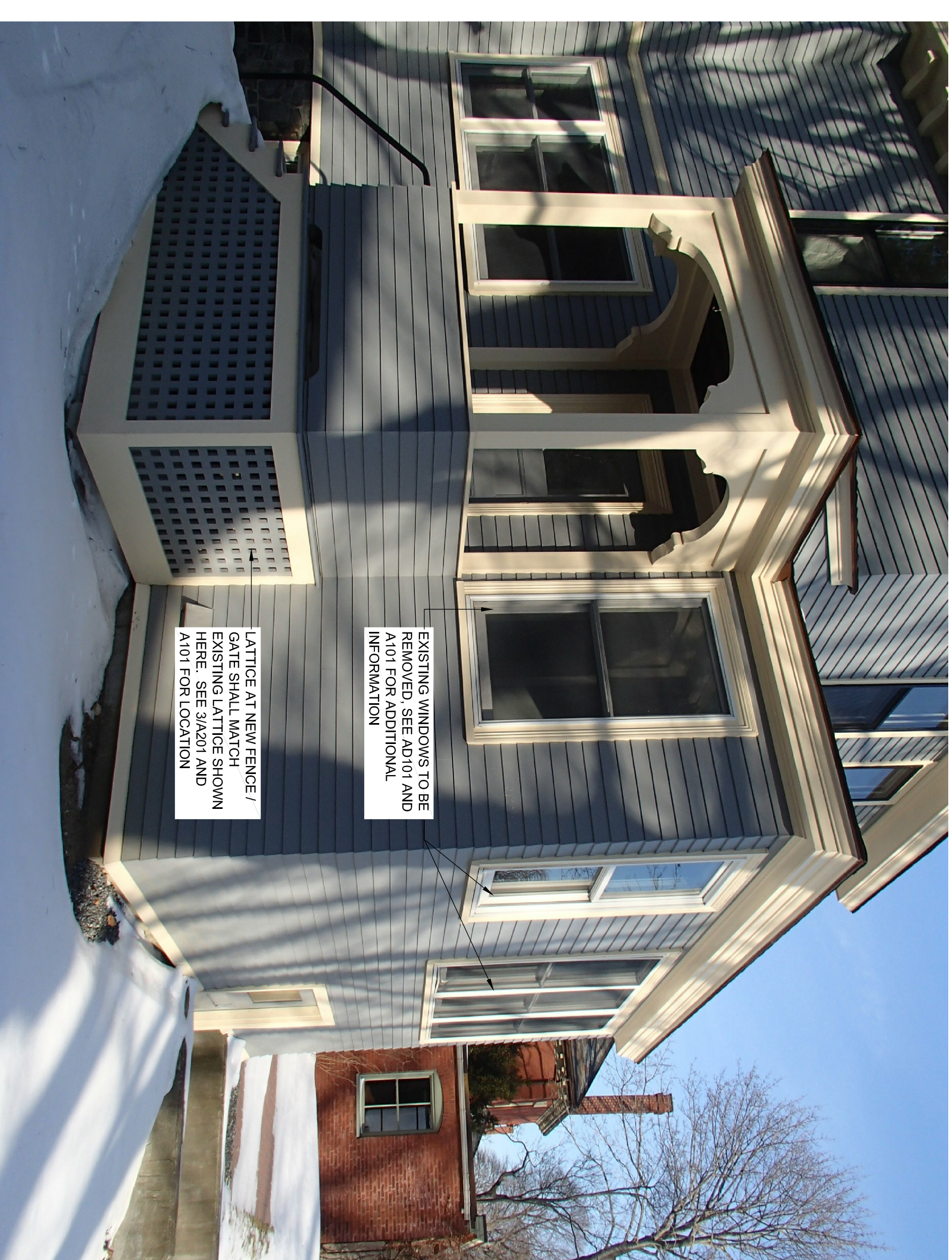
4 PHOTO SHOWING INTENT FOR FENCE / GATE LATTICE SCALE: 1/4" = 1'-0"