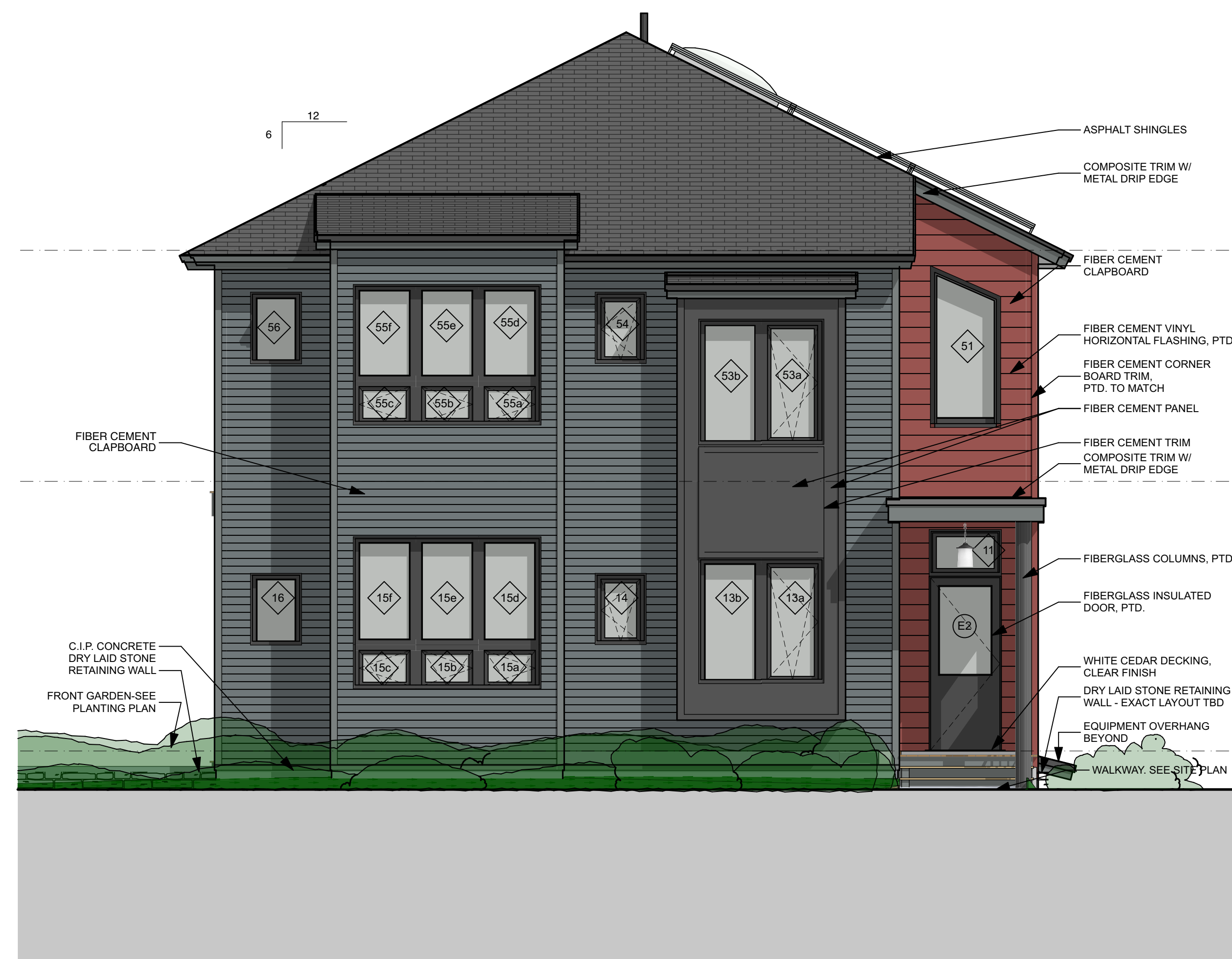
1 NORTH ELEVATION: DANFORTH ST.