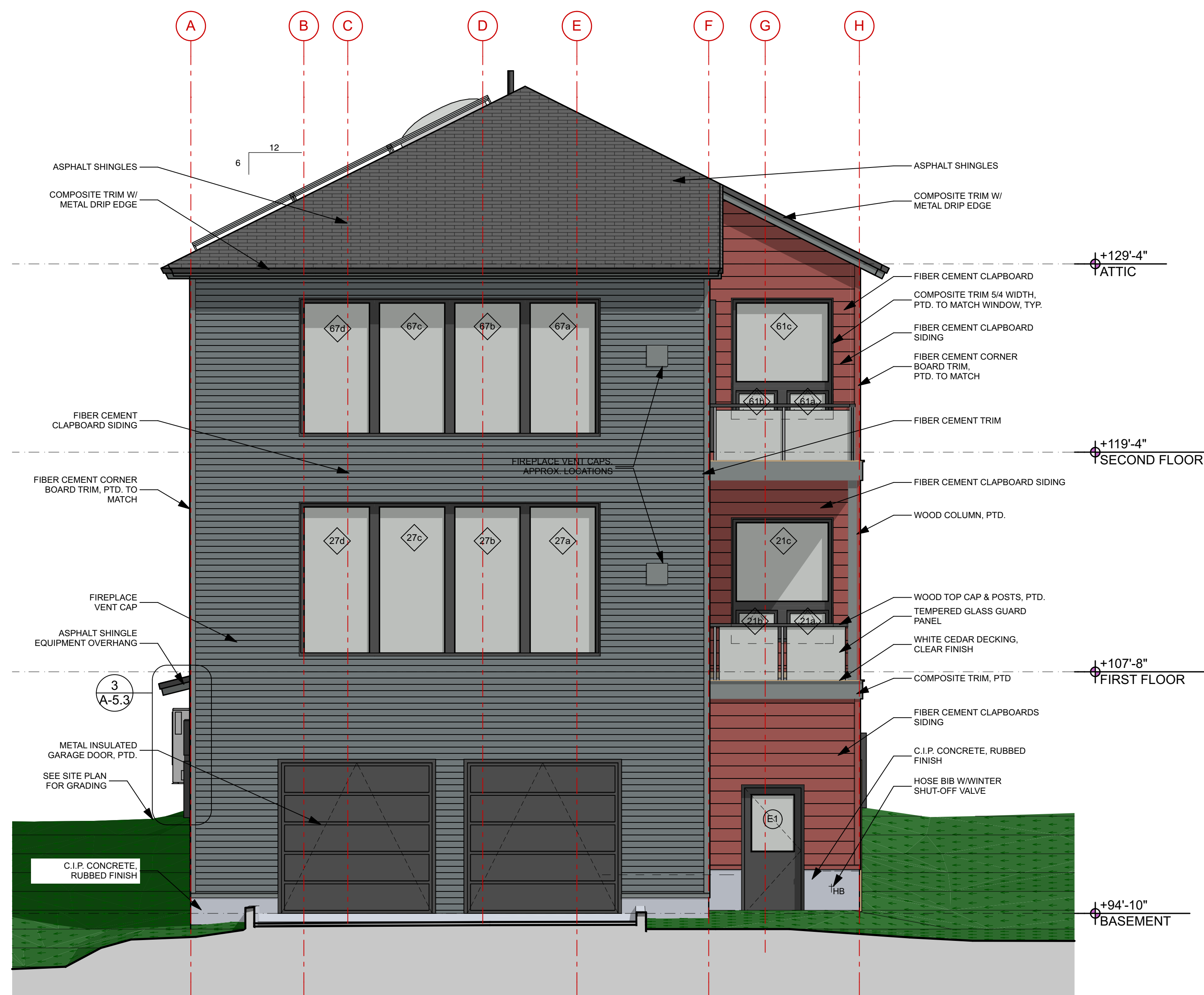
2 SOUTH ELEVATION SCALE: 1/4" = 1'-0"