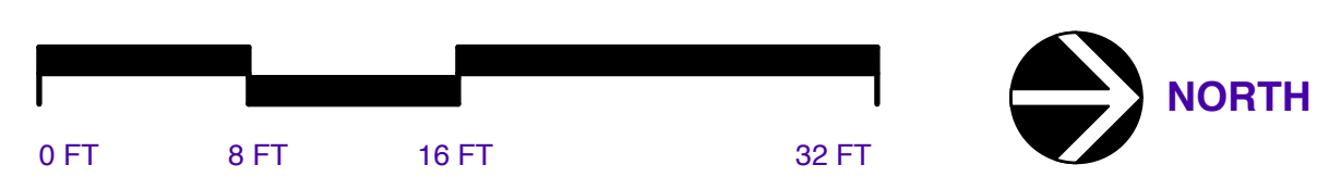
1 FIRST FLOOR PLAN SCALE: 1/8" = 1'-0"

500 SF OF EXISTING ROOM (E) TO BE USED AS CLASSROOM (E) SPACE DURING THE CONSTRUCTION OF THE NEW LOWER SCHOOL. NO CHANGE IN ORIGINAL OCCUPANCY CALCULATION SINCE 20 SF PER PERSONS HAD BEEN CARRIED. 2017.04.24 Scott Simons Architects