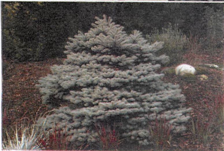
Picea pungens 'Montgomery'