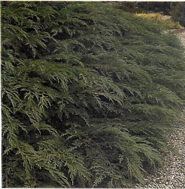
Microbiota 'Siberian Carpet Cypress'