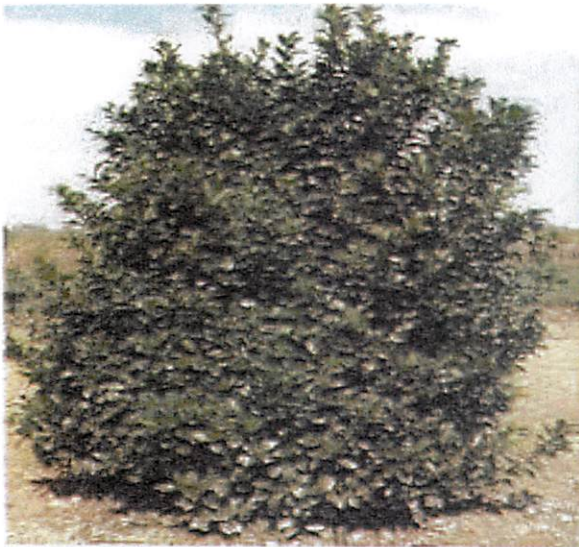
Ilex 'Blue Princess' Holly