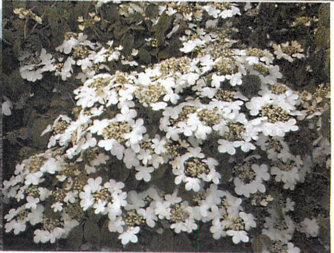
Viburnum 'Summer Snowflake'