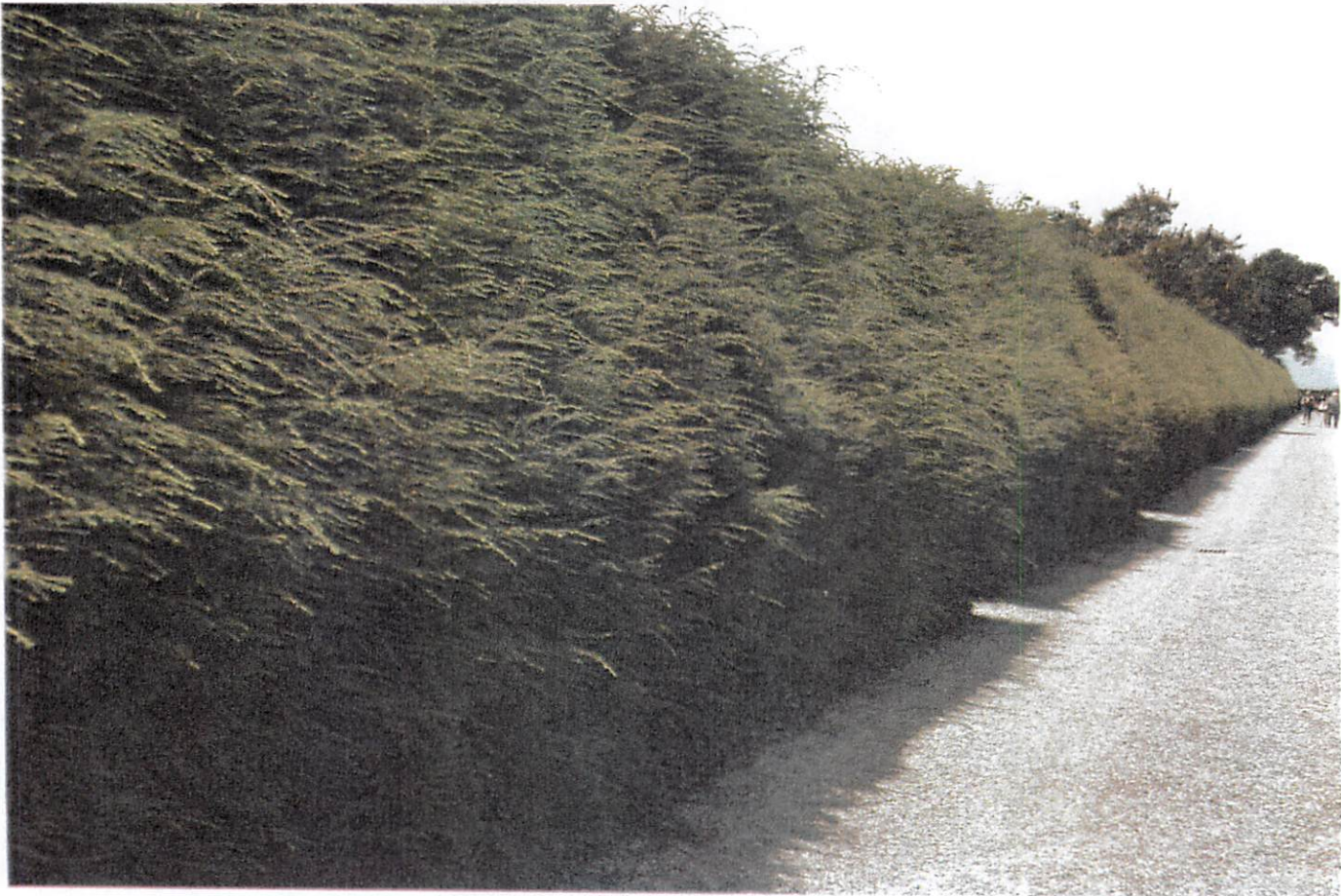
Tsuga Canadensis Canadian Hemlock