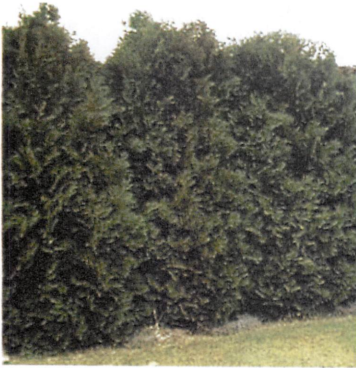
Thuja plicata 'Evergreen Giant'