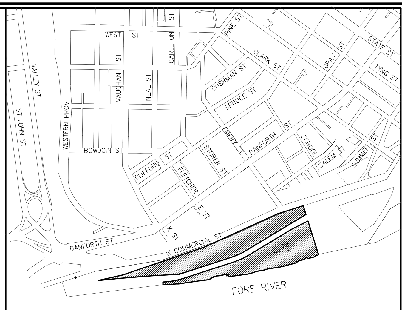
LOCATION MAP N.T.S.

UTILITY NOTE THE UNDERGROUND UTILITIES SHOWN HAVE BEEN LOCATED FROM FIELD SURVEY INFORMATION AND EXISTING DRAWINGS. THE SURVEYOR MAKES NO GUARANTEES THAT THE UNDERGROUND UTILITIES SHOWN COMPRISE ALL SUCH UTILITIES IN THE AREA, EITHER IN SERVICE OR ABANDONED. THE SURVEY FURTHER DOES NOT WARRANT THAT THE UNDERGROUND UTILITIES SHOWN ARE IN THE EXACT LOCATION INDICATED ALTHOUGH HE DOES CERTIFY THAT THEY ARE LOCATED AS ACCURATELY AS POSSIBLE FROM THE INFORMATION AVAILABLE. THE SURVEYOR HAS NOT PHYSICALLY LOCATED THE UNDERGROUND UTILITIES. CALL 1-800-DIGSAFE AT LEAST THREE BUSINESS DAYS BEFORE PERFORMING ANY CONSTRUCTION.