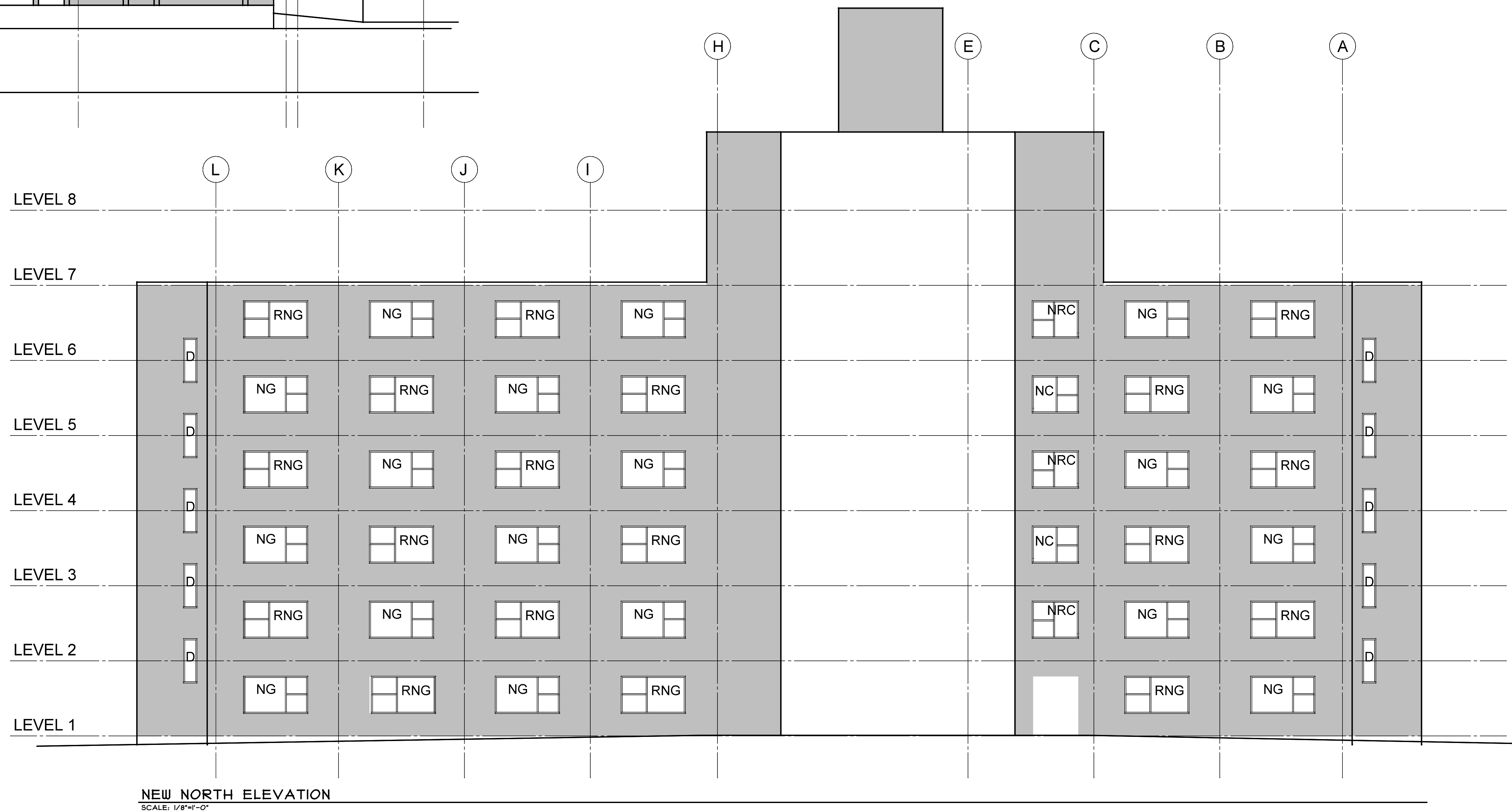
NEW NORTH ELEVATION SCALE: 1/8"=1'-0"