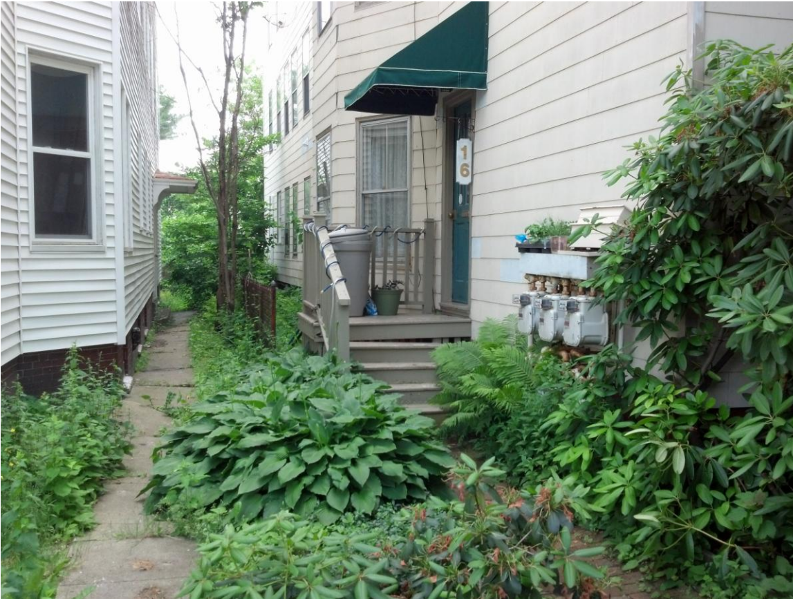
View of steps from the sidewalk.