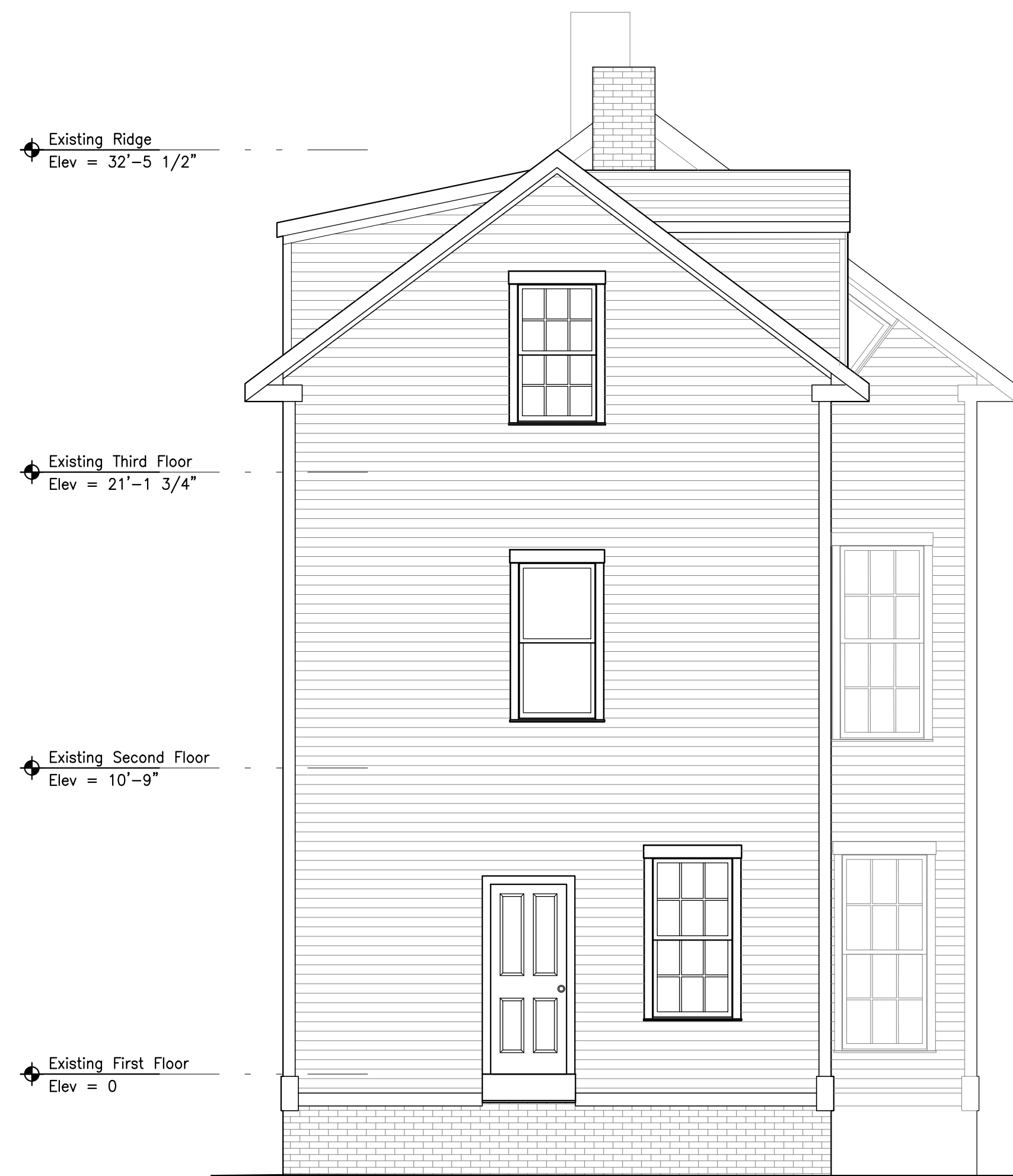
3a Existing North Elevation Scale: 1/4" = 1'-0"