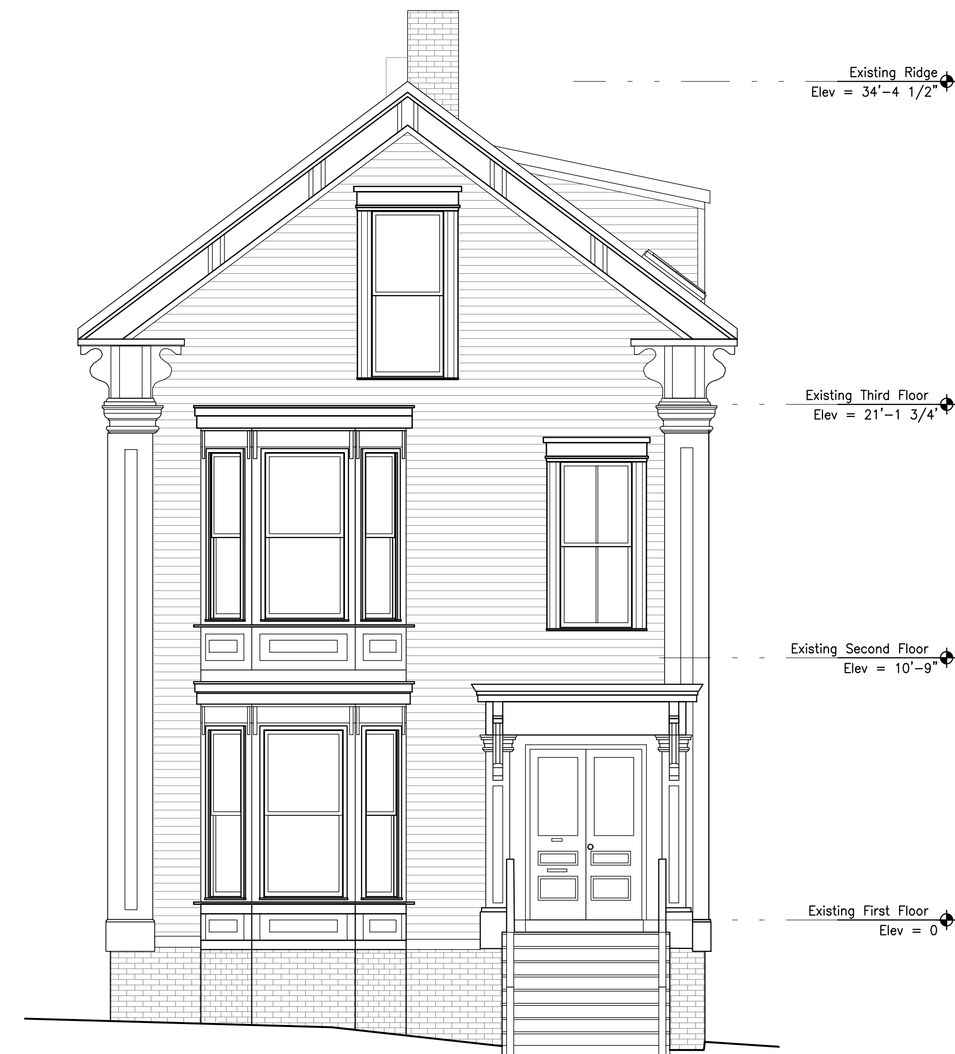
2a Existing South Elevation Scale: 1/4" = 1'-0"