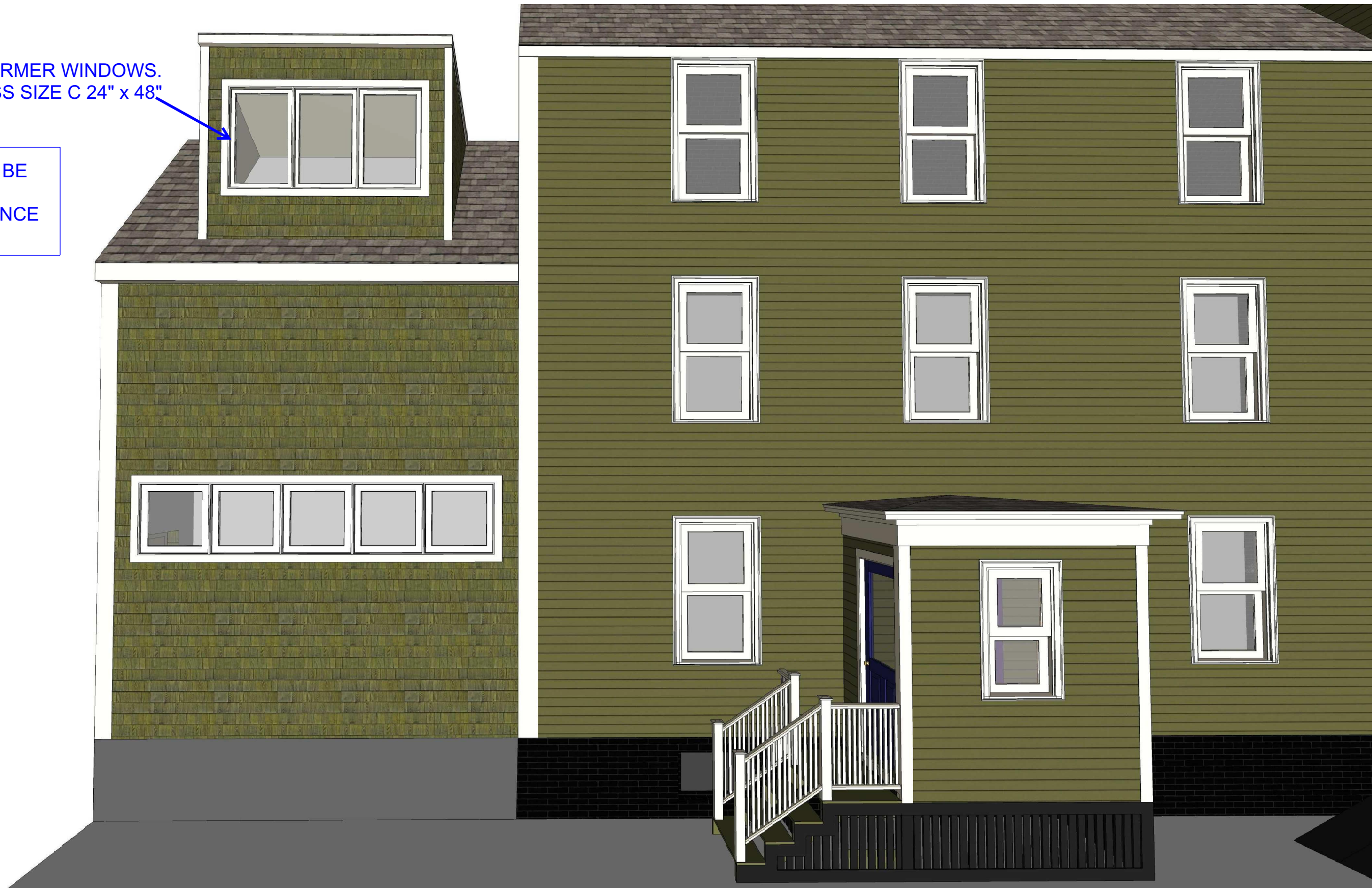
57 SPRUCE ST., WEST VIEW REVISED 2015.02.20

NEW WINDOW GLAZING TO BE CARDINAL LoE2-272, VISUAL LIGHT TRANSMITTANCE VALUE OF 72%