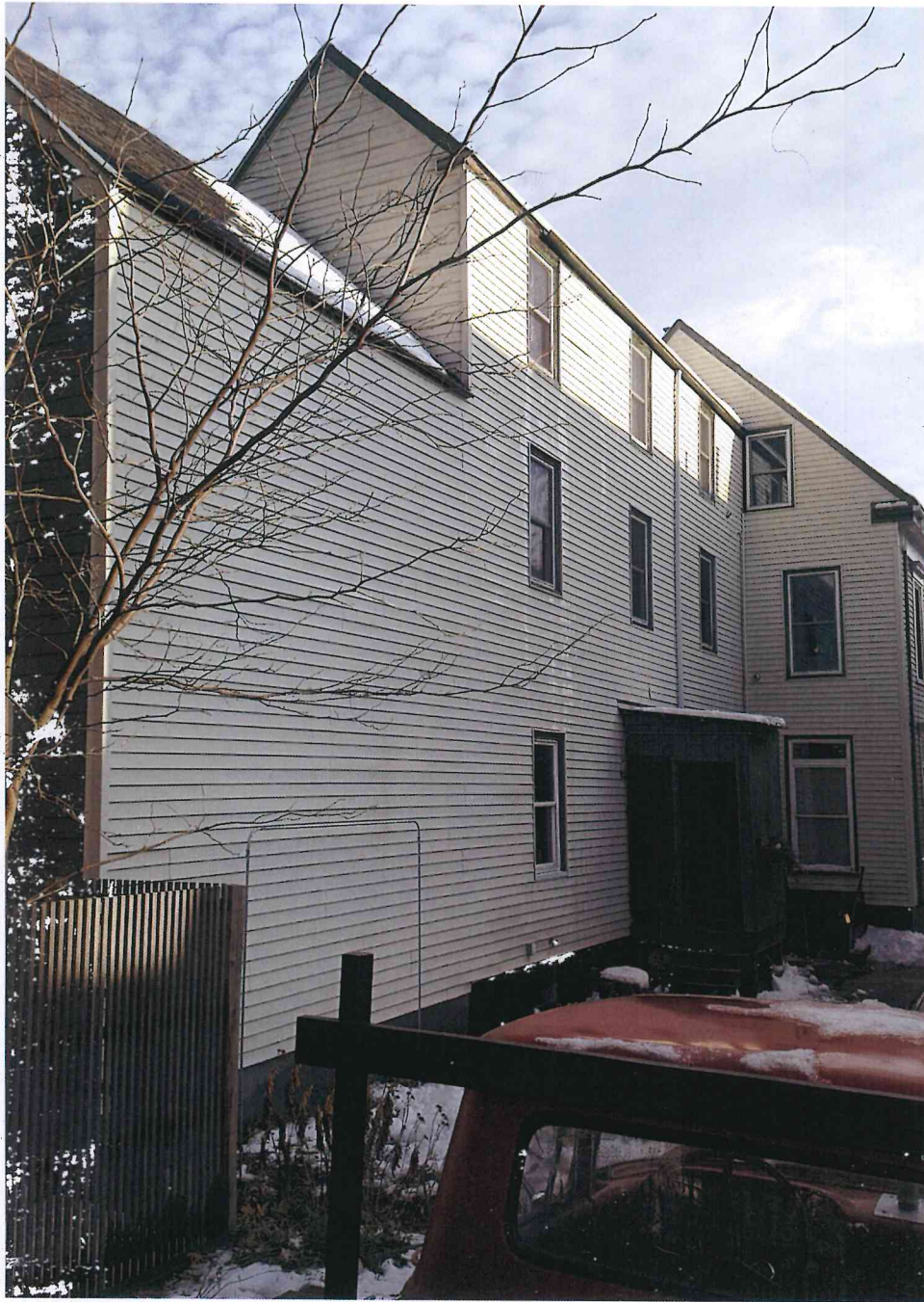
LEFT - WEST