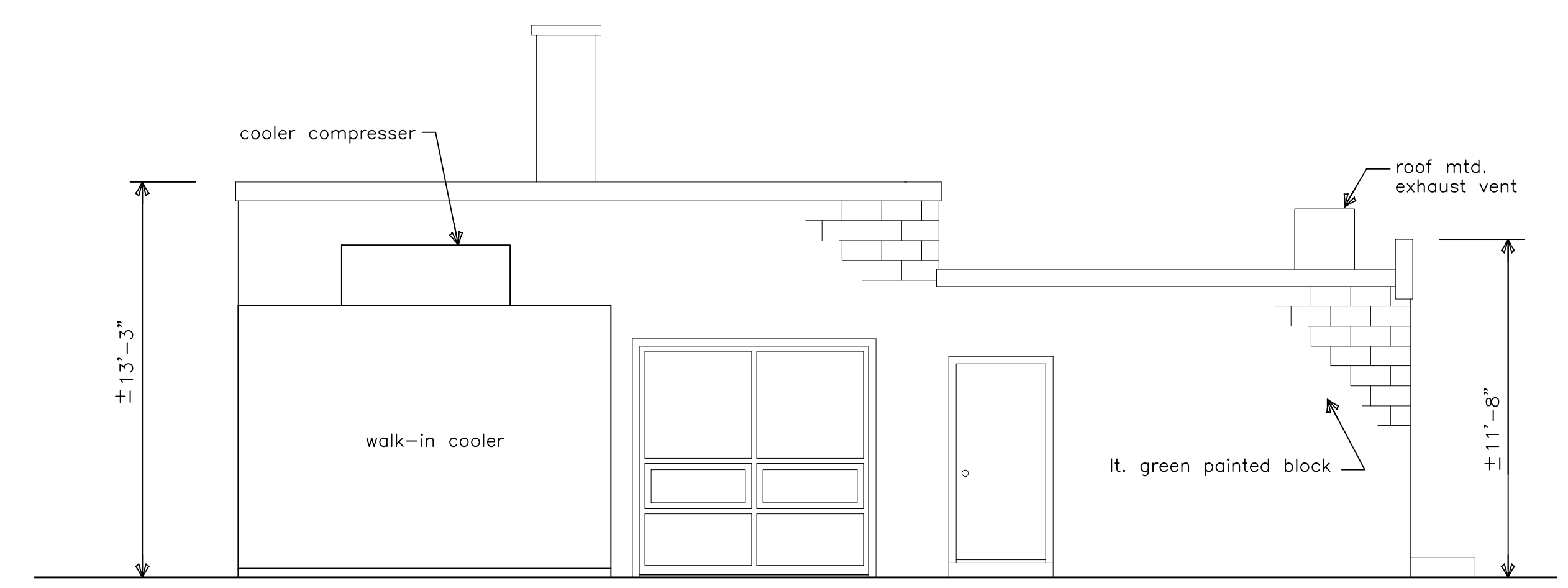
3 A-8 REAR ELEVATION - Existing Scale: 1/4" = 1'-0"