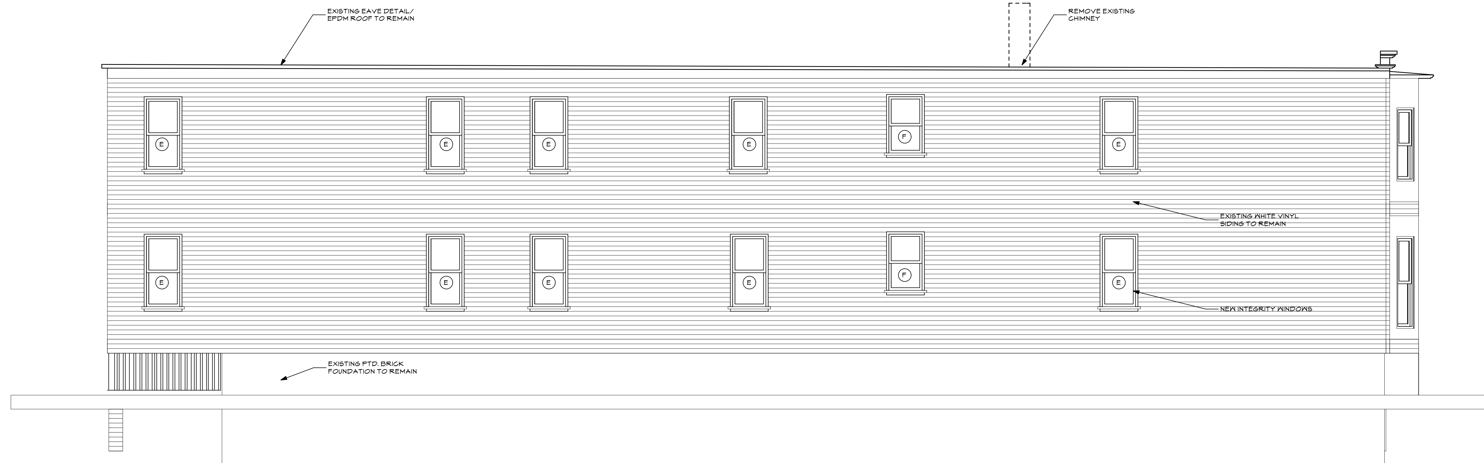
1 A2.2 Left Side Elevation SCALE: 1/4" = 1'-0"