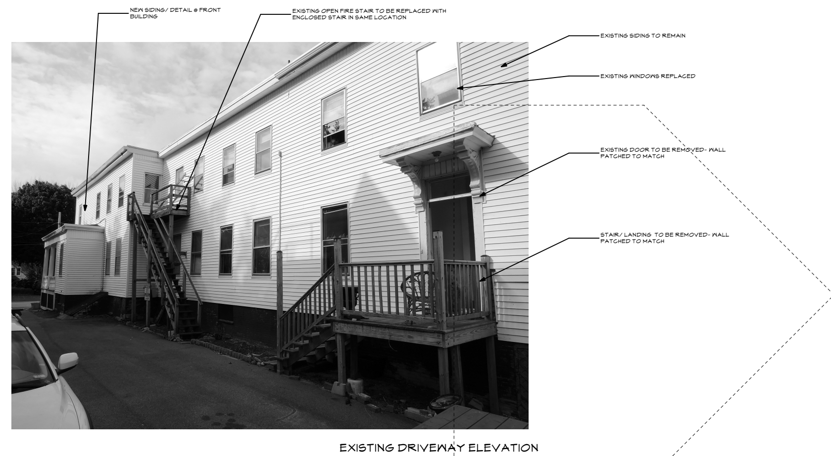
EXISTING DRIVEWAY ELEVATION