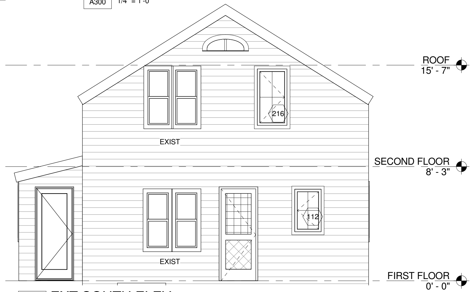
1 EXT SOUTH ELEV A300 1/4" = 1'-0"