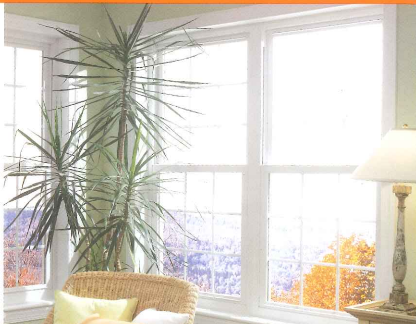
The versatile, state-of-the-art Double Hung (above) features a classic look with optimum energy efficiency

*Configured and available only on double hung windows