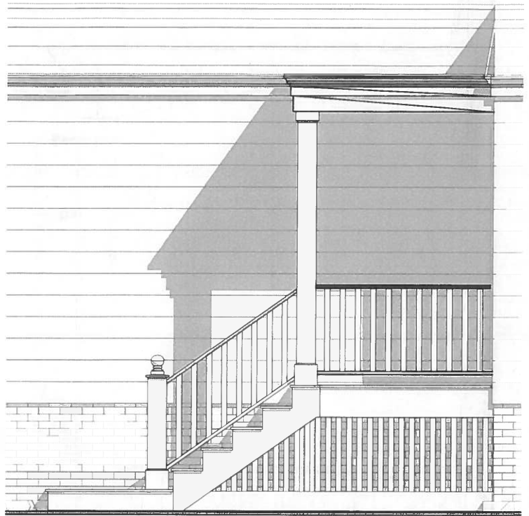
2 Right Elev. SCALE: 1/4" = 1'-0"