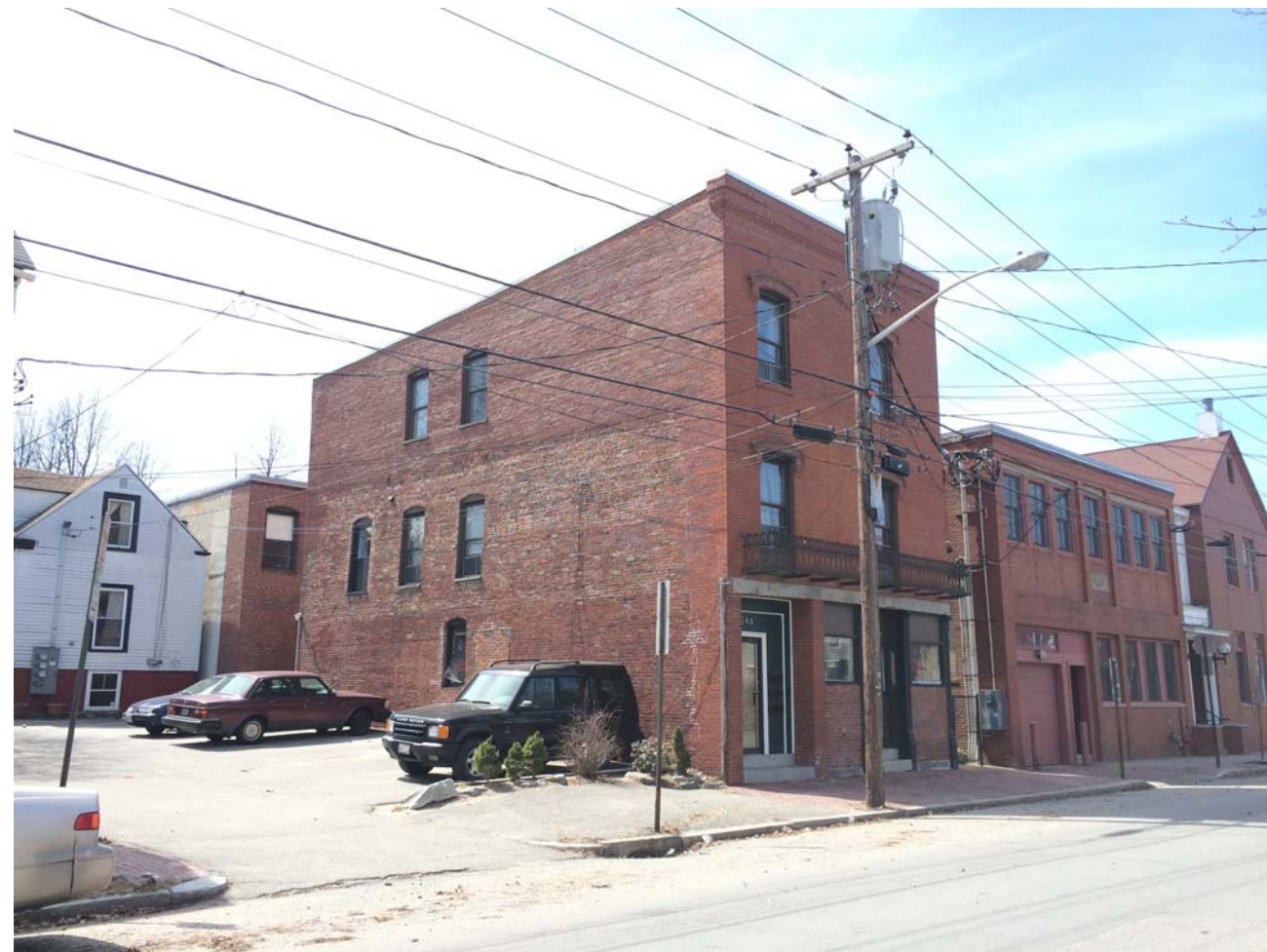
246 BRACKETT STREET

DEXTROUS CREATIVE, LLC Portland, ME 04102 207.409.0459 traciereed@dextrouscreative.com