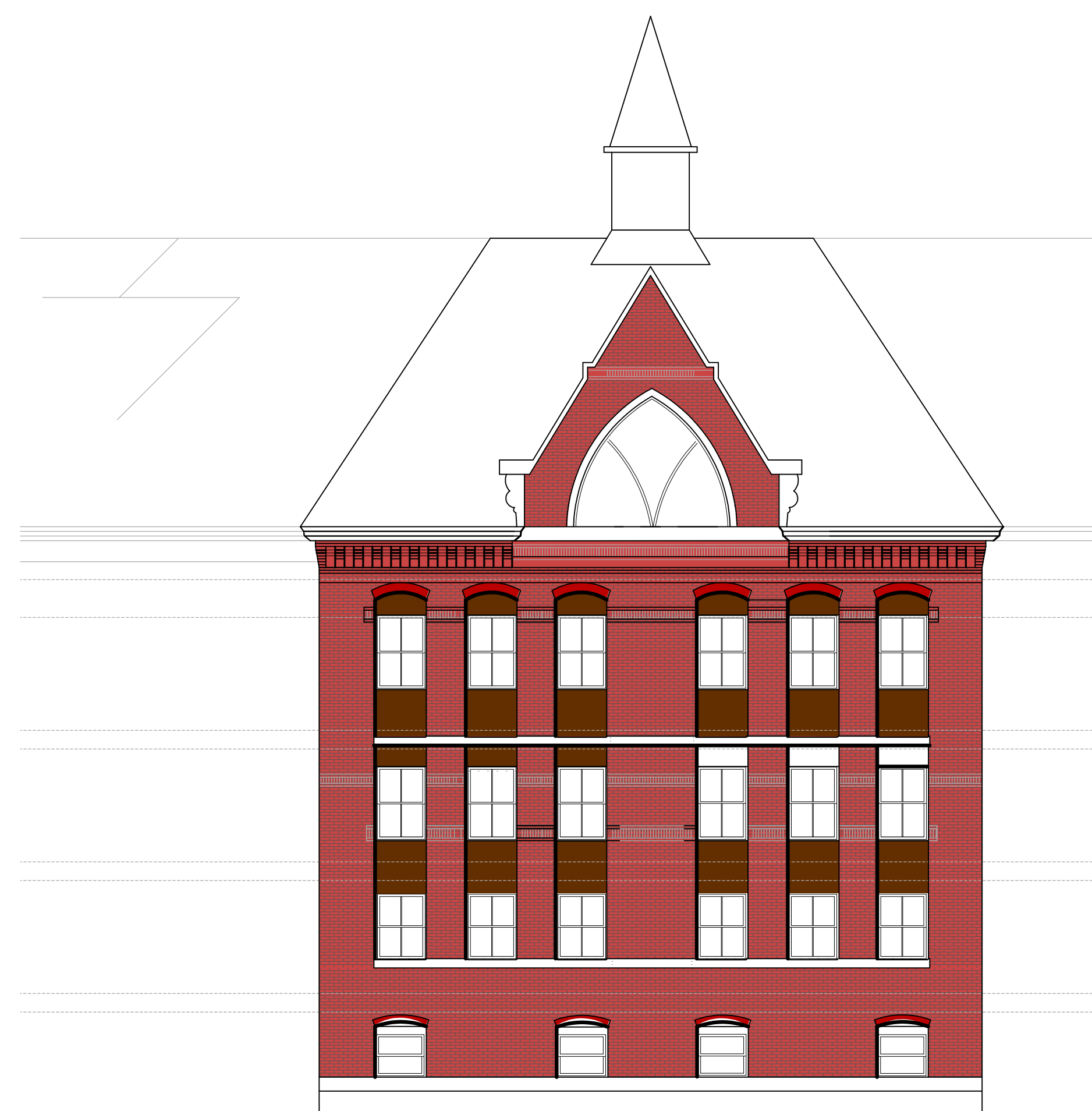
Elevation at intersection Existing conditions