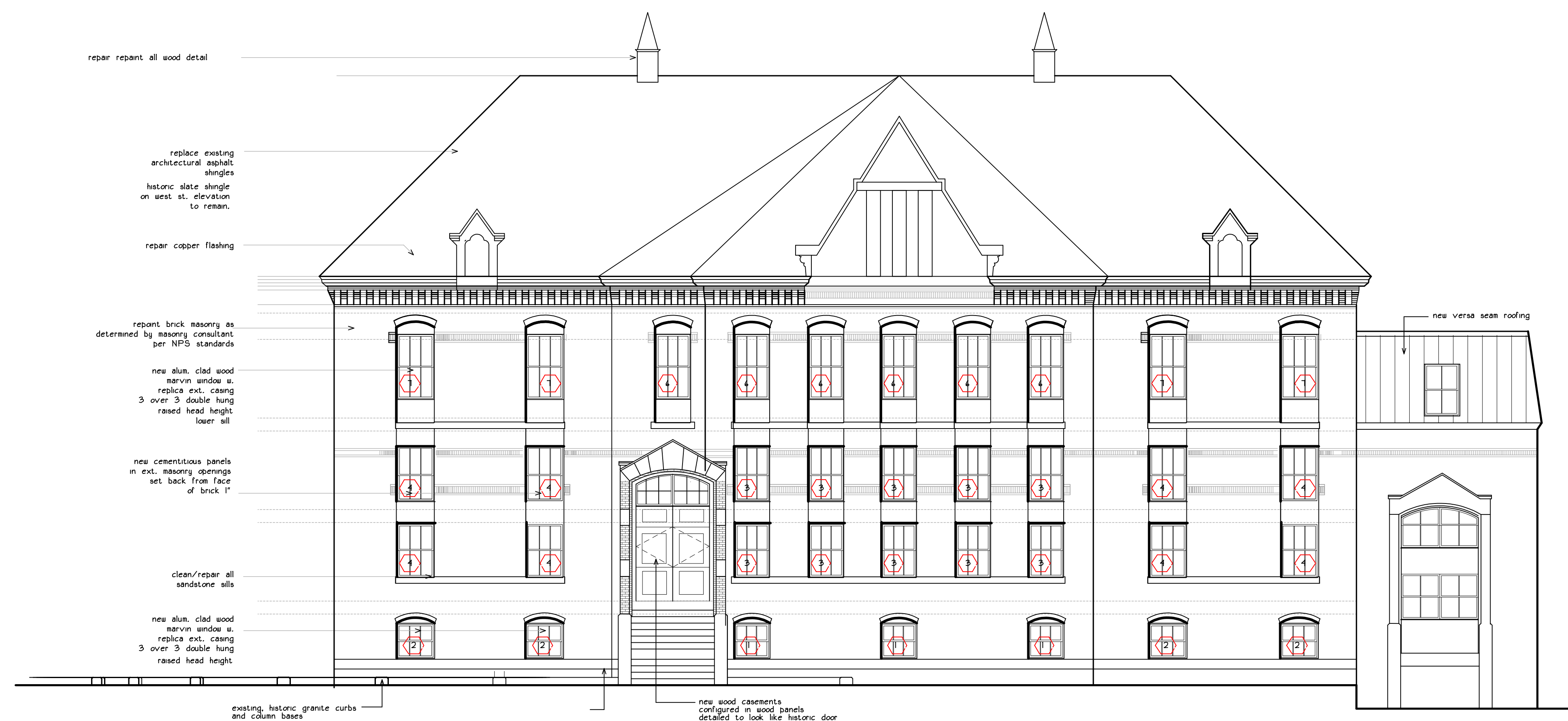
West Street Elevation (mirror for pine street elevation)