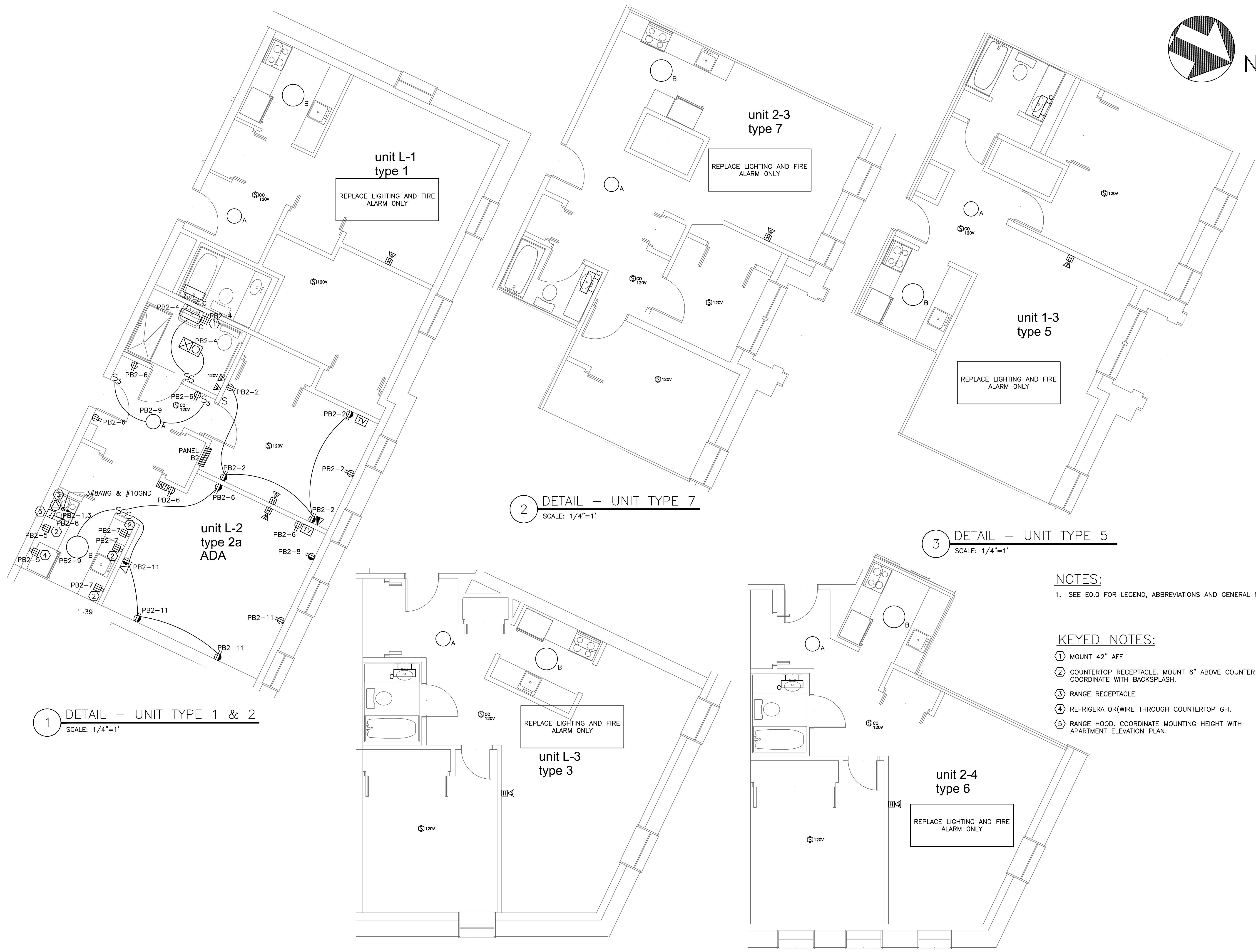
2 DETAIL - UNIT TYPE 7 SCALE: 1/4"=1'