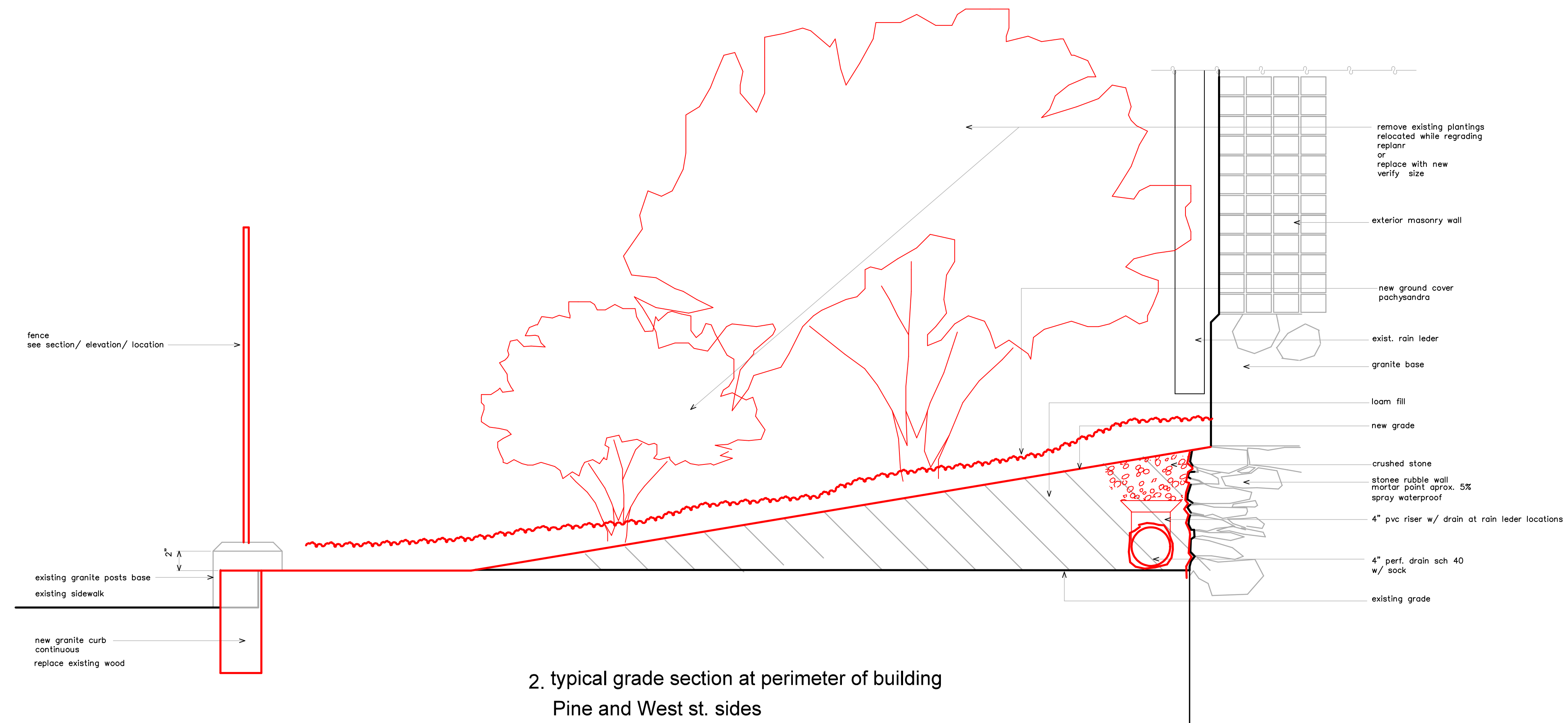
2. typical grade section at perimeter of building Pine and West st. sides