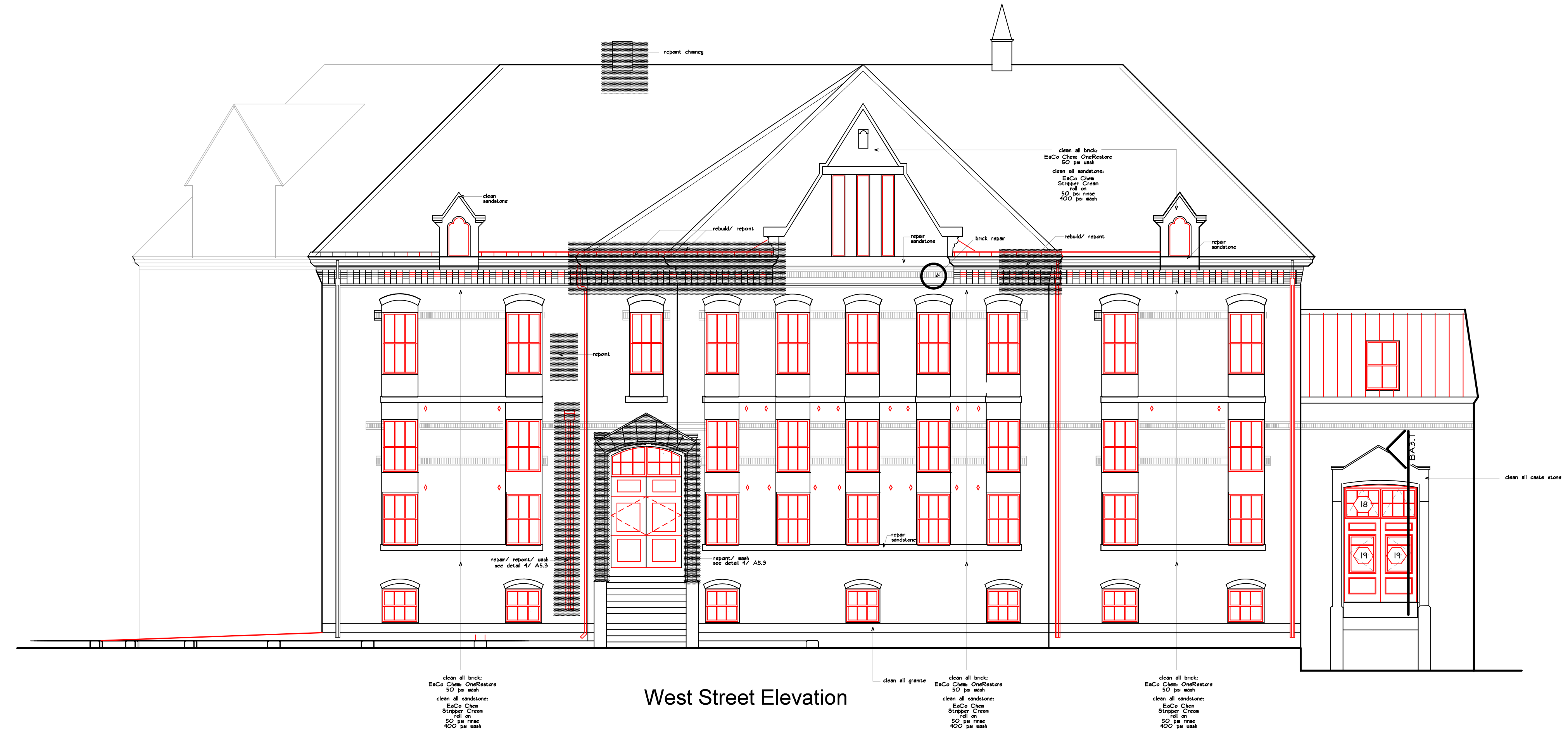
West Street Elevation