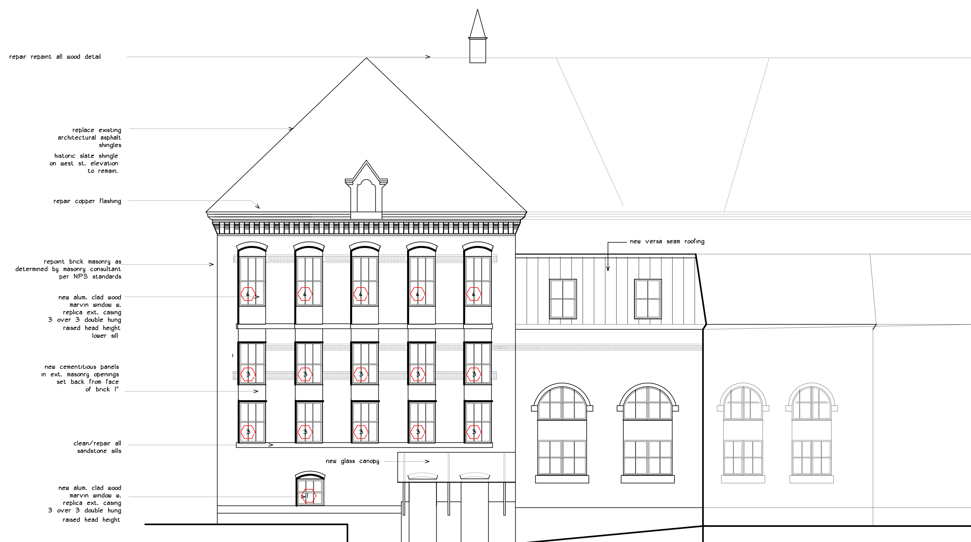
west street entrance