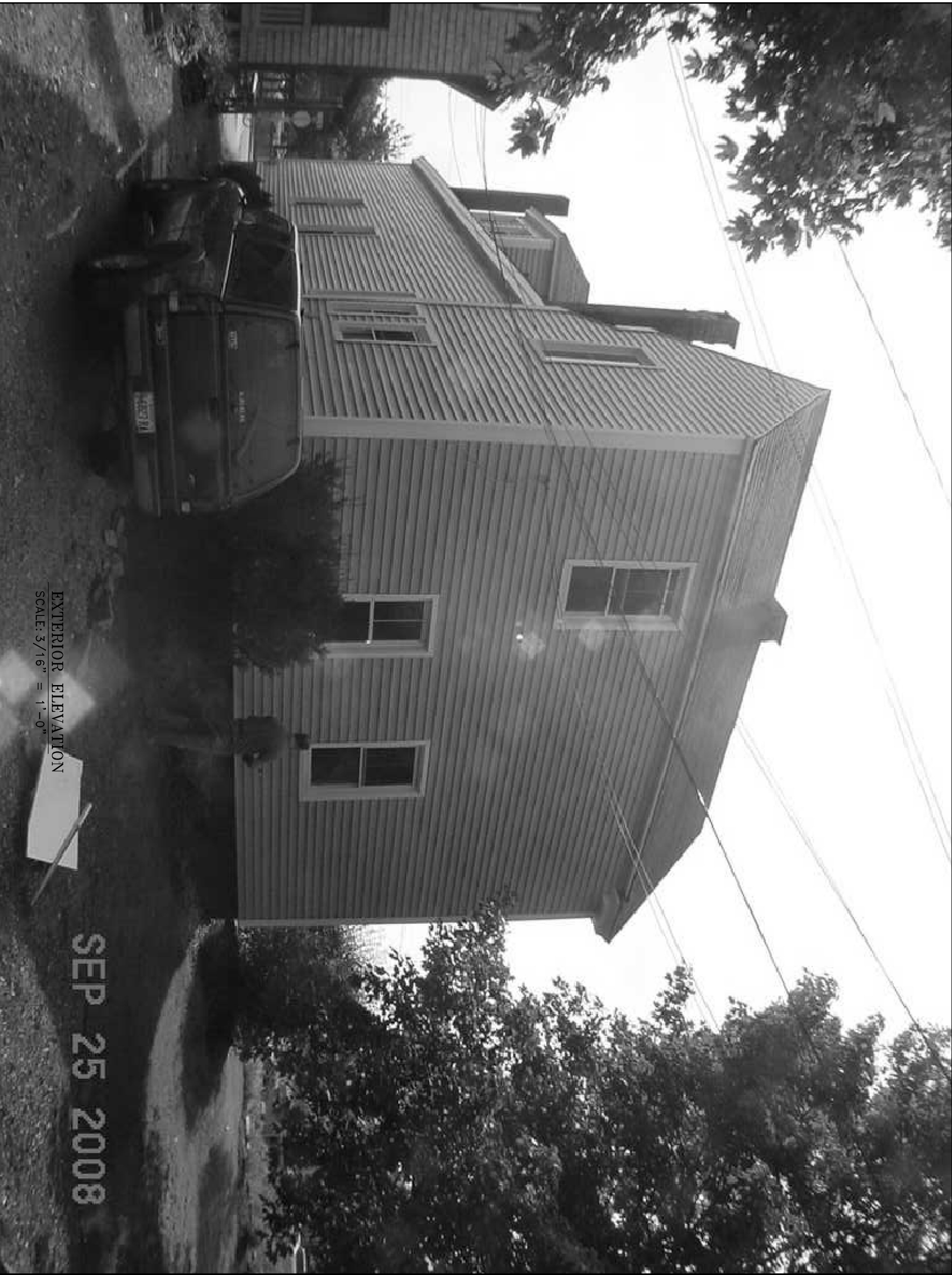
EXTERIOR ELEVATION SCALE: 3/16" = 1'-0"