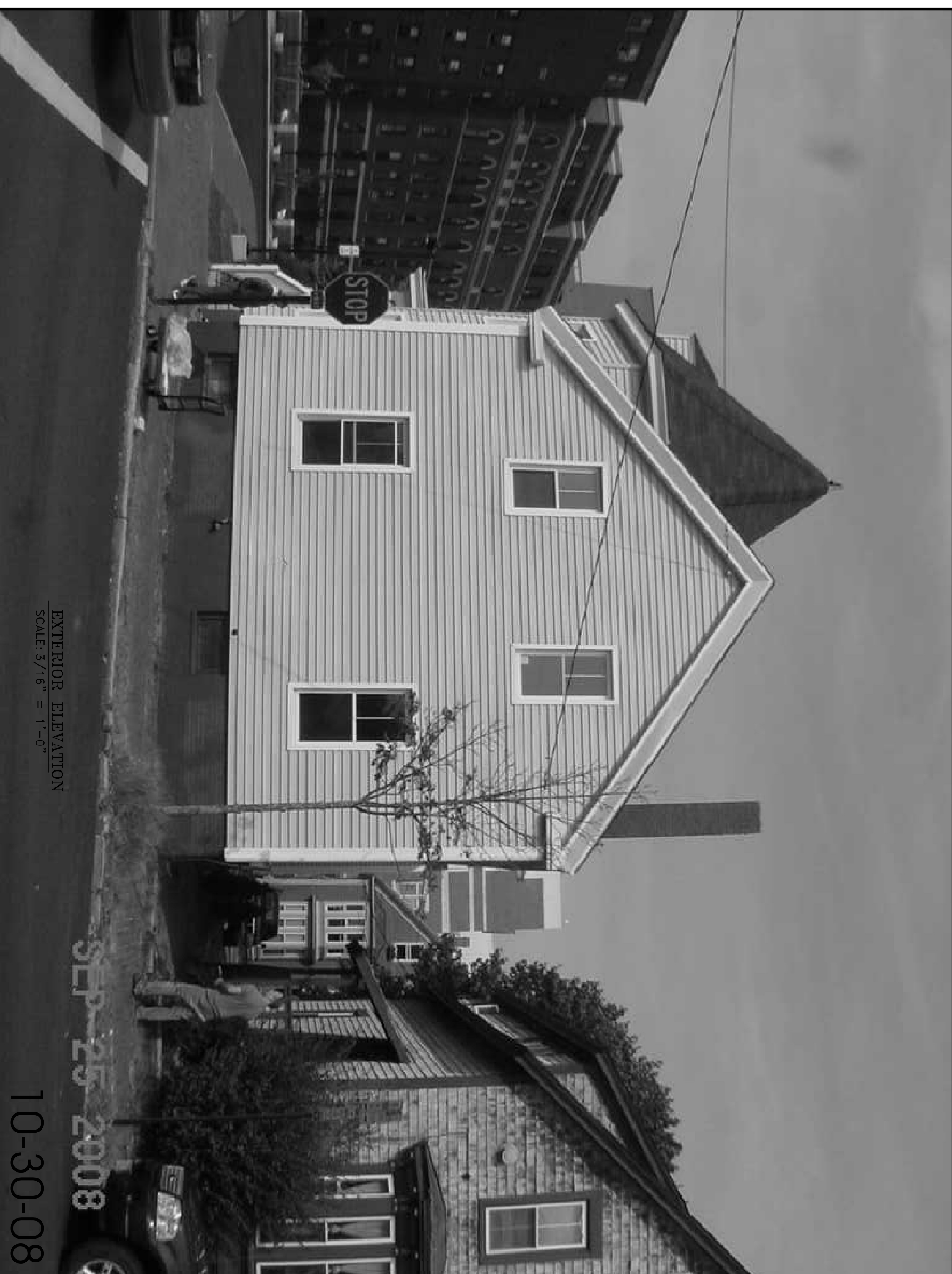
EXTERIOR ELEVATION SCALE: 3/16" = 1'-0"