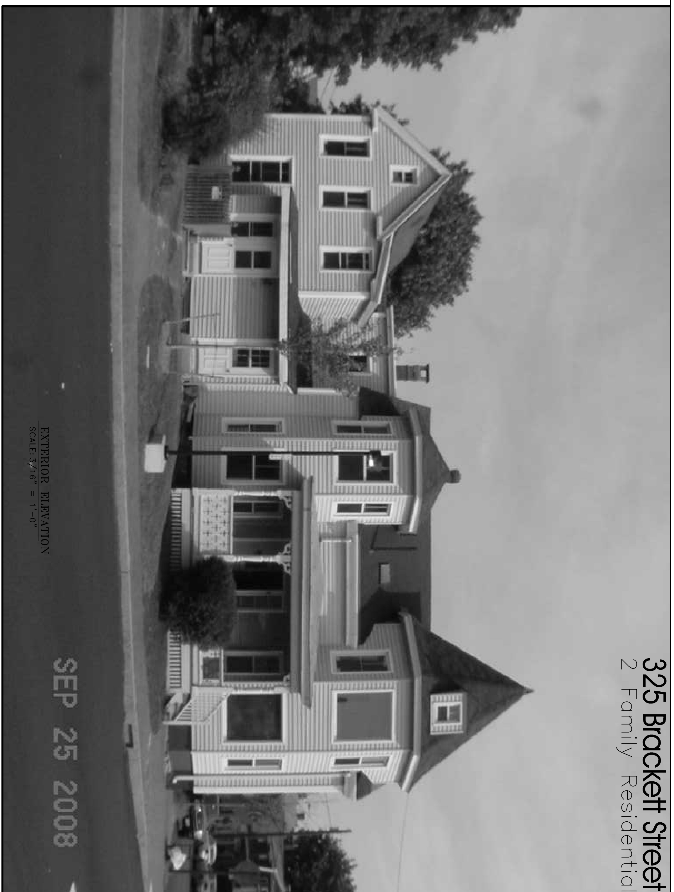
EXTERIOR ELEVATION SCALE: 3/16" = 1'-0"