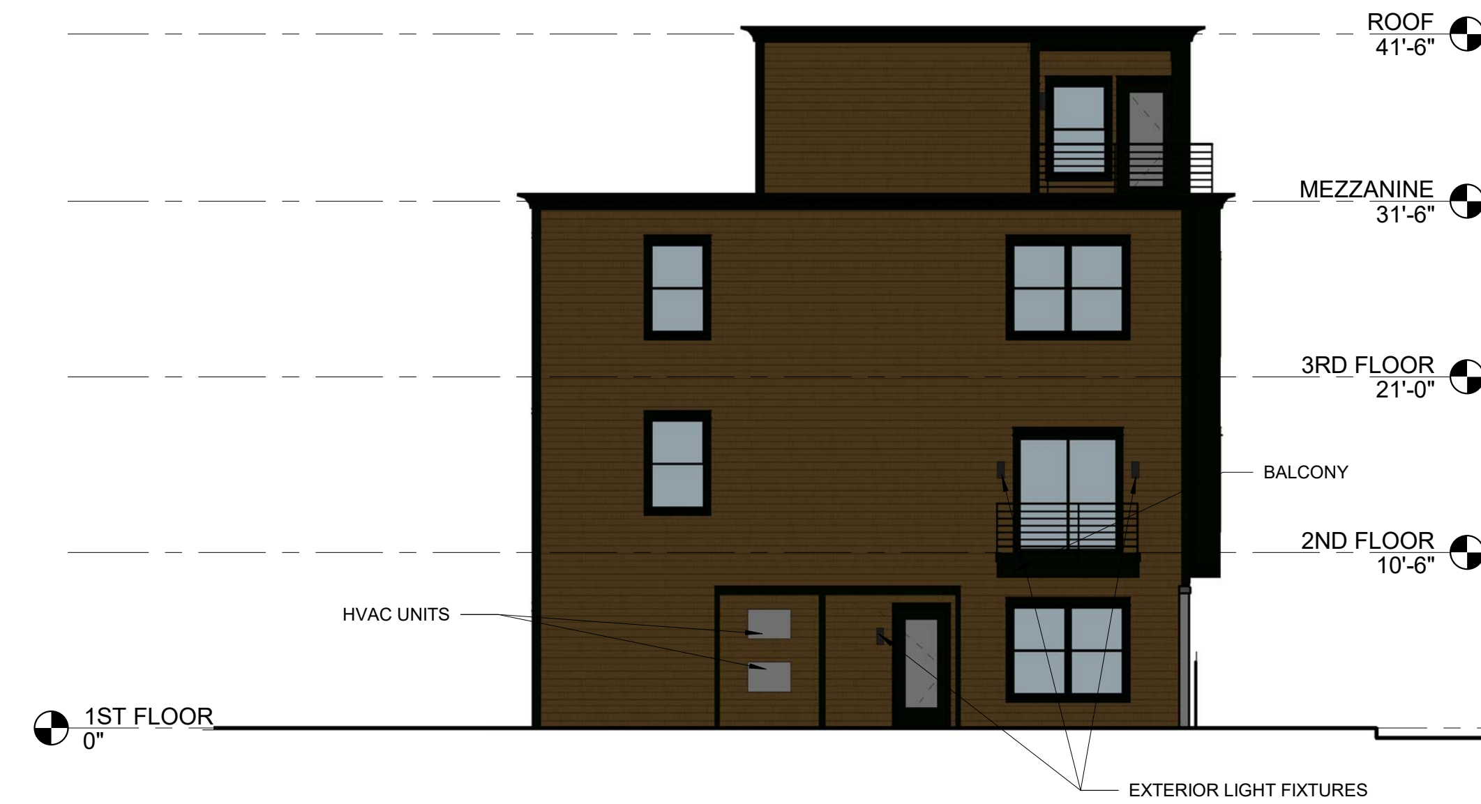
4 SOUTH ELEVATION 1/8" = 1'-0"