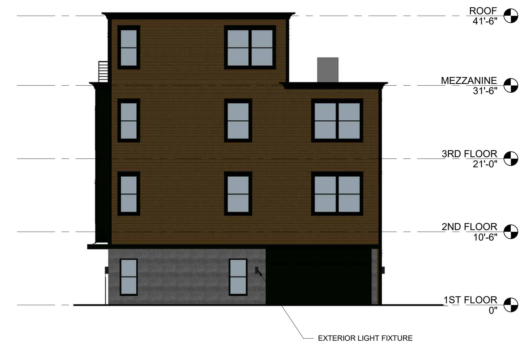
2 NORTH ELEVATION 1/8" = 1'-0"