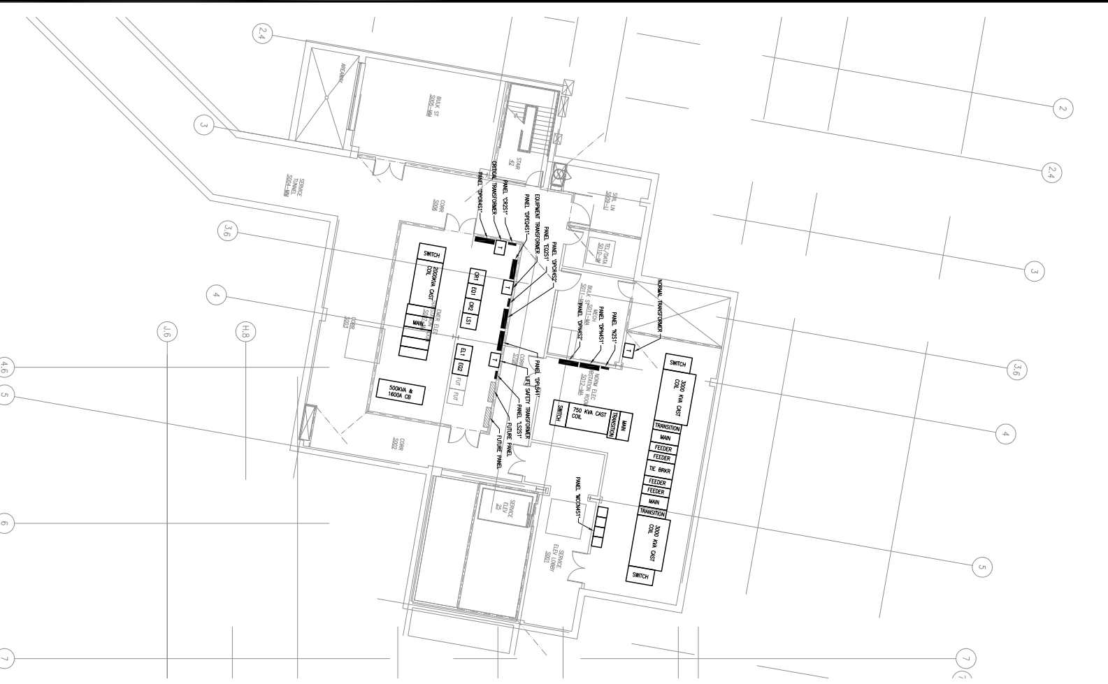
2 POWER EQUIPMENT PLAN SCALE: 1/8"=1'-0"

ISSUE DATE: 09/27/14 FOR PERMIT ONLY NOT FOR CONSTRUCTION SCALE LOG 09/27/14 FERRIS ST - NET FOR CONSTRUCTION