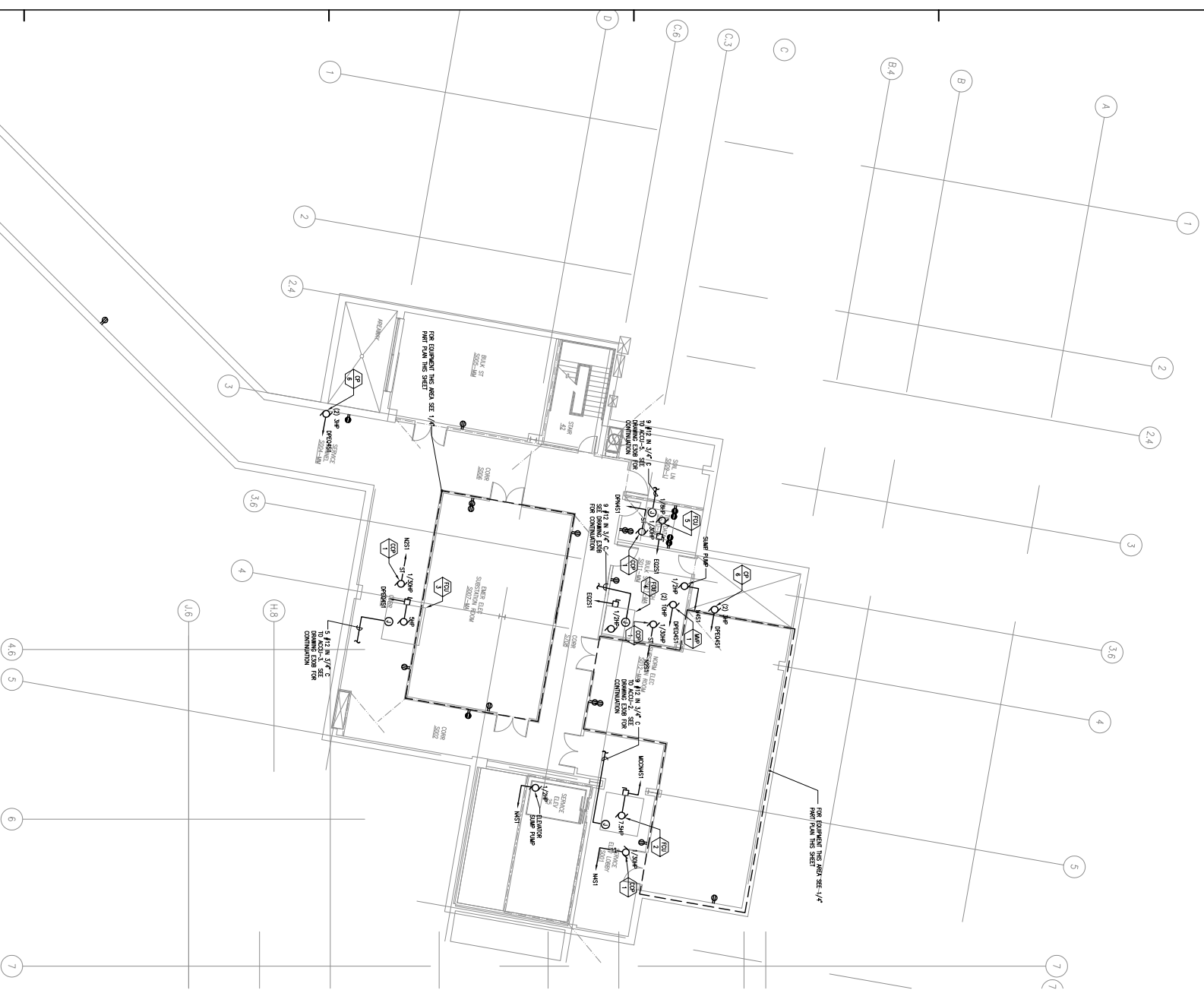
1 POWER PLAN SCALE: 1/8"=1'-0"