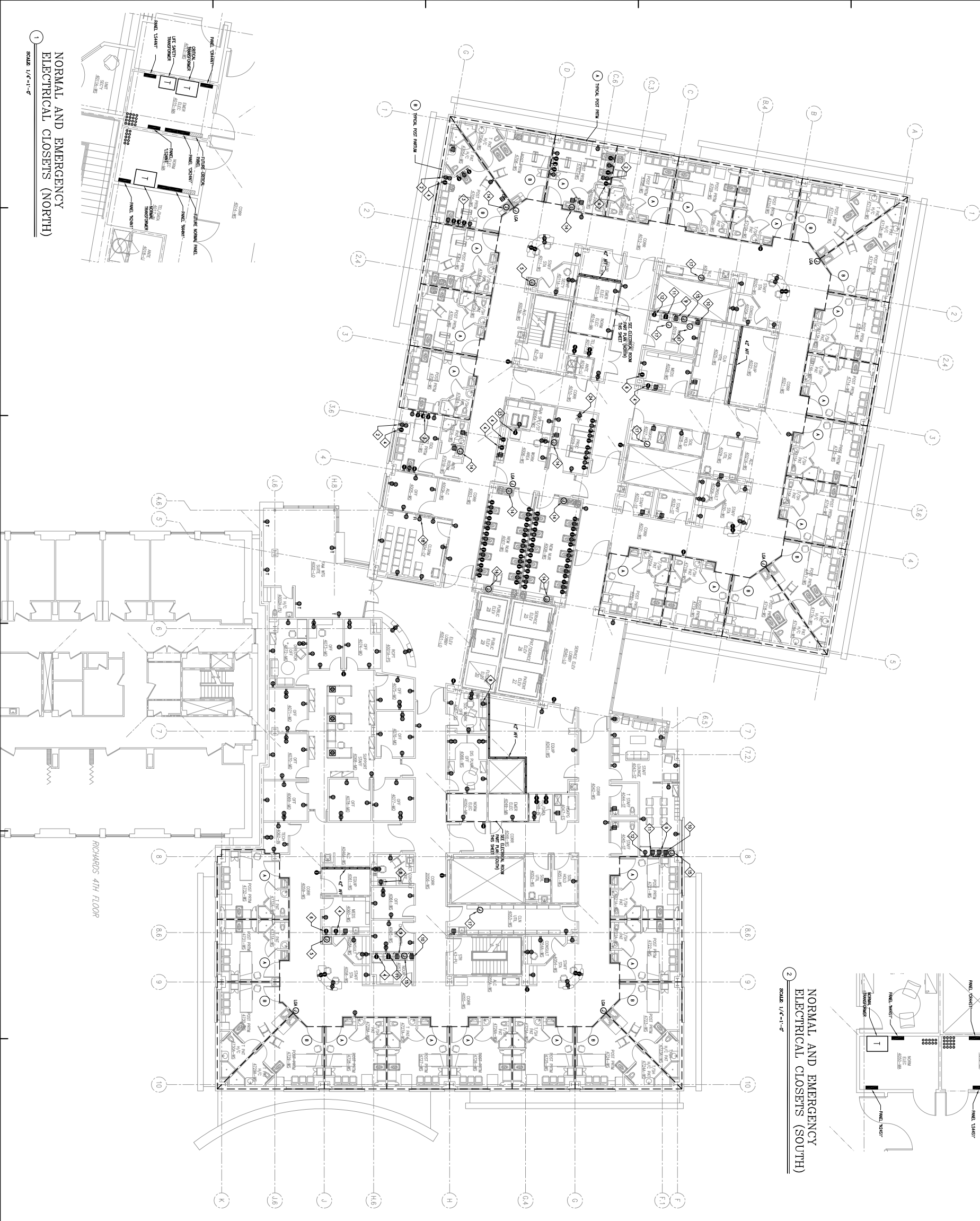
1 NORMAL AND EMERGENCY ELECTRICAL CLOSETS (NORTH) SCALE: 1/4" = 1'-0"