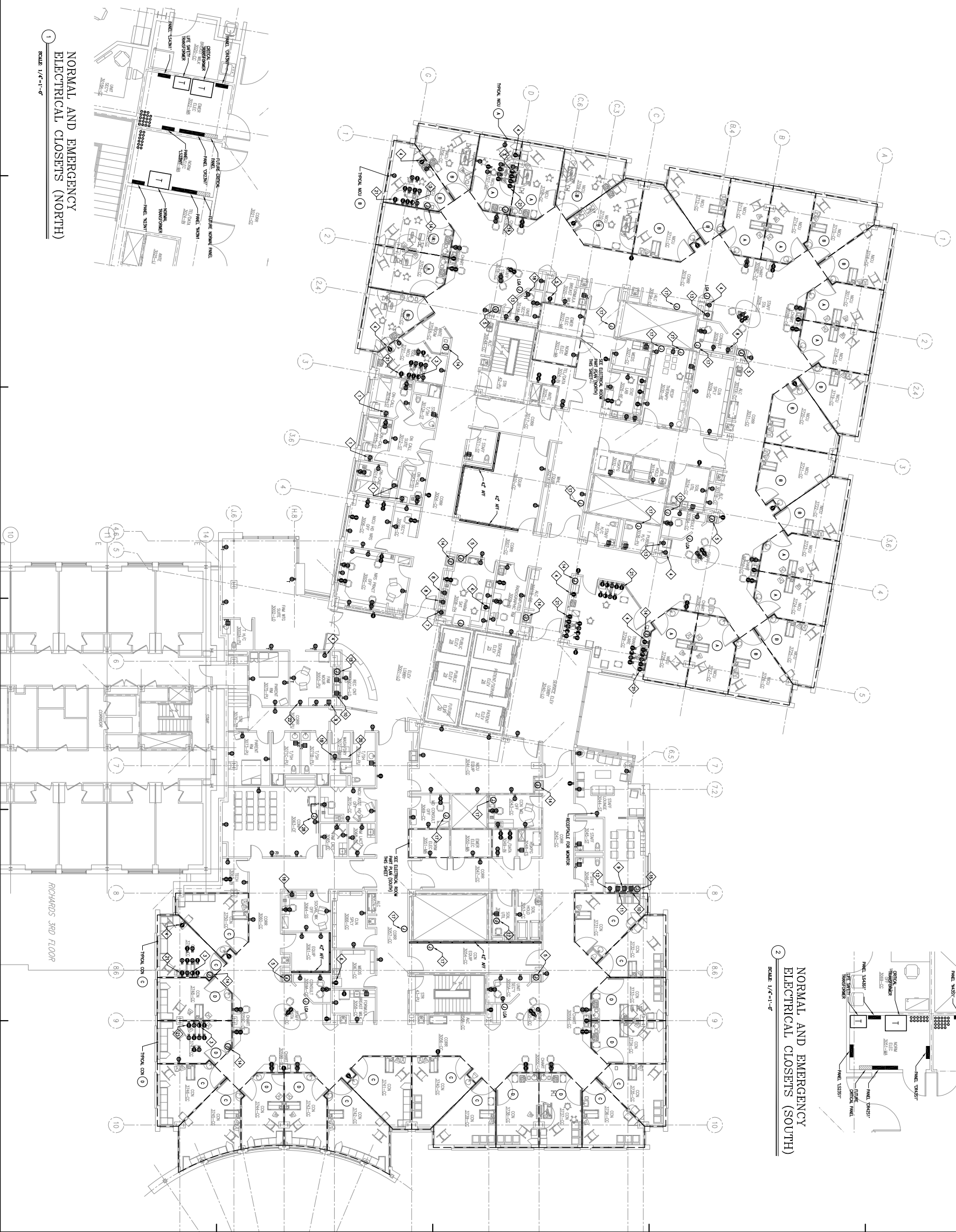
1 NORMAL AND EMERGENCY ELECTRICAL CLOSETS (NORTH) SCALE: 1/4"=1'-0"