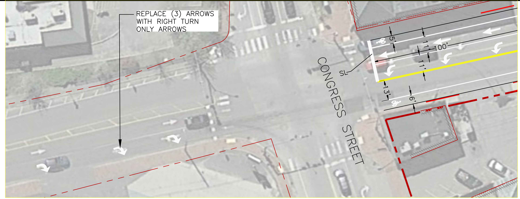
ST. JOHN STREET AND CONGRESS STREET INTERSECTION DETAIL