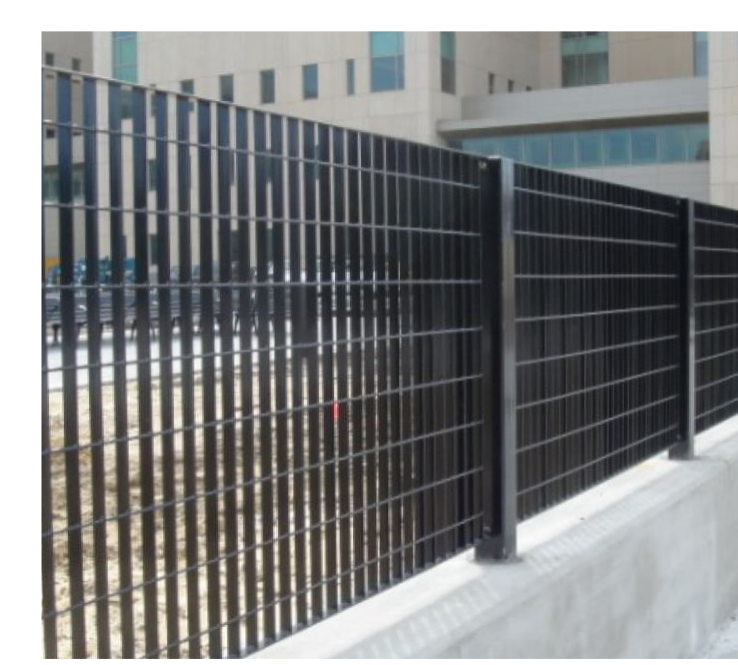
ST 1 SECURITY GRILLE DETAIL