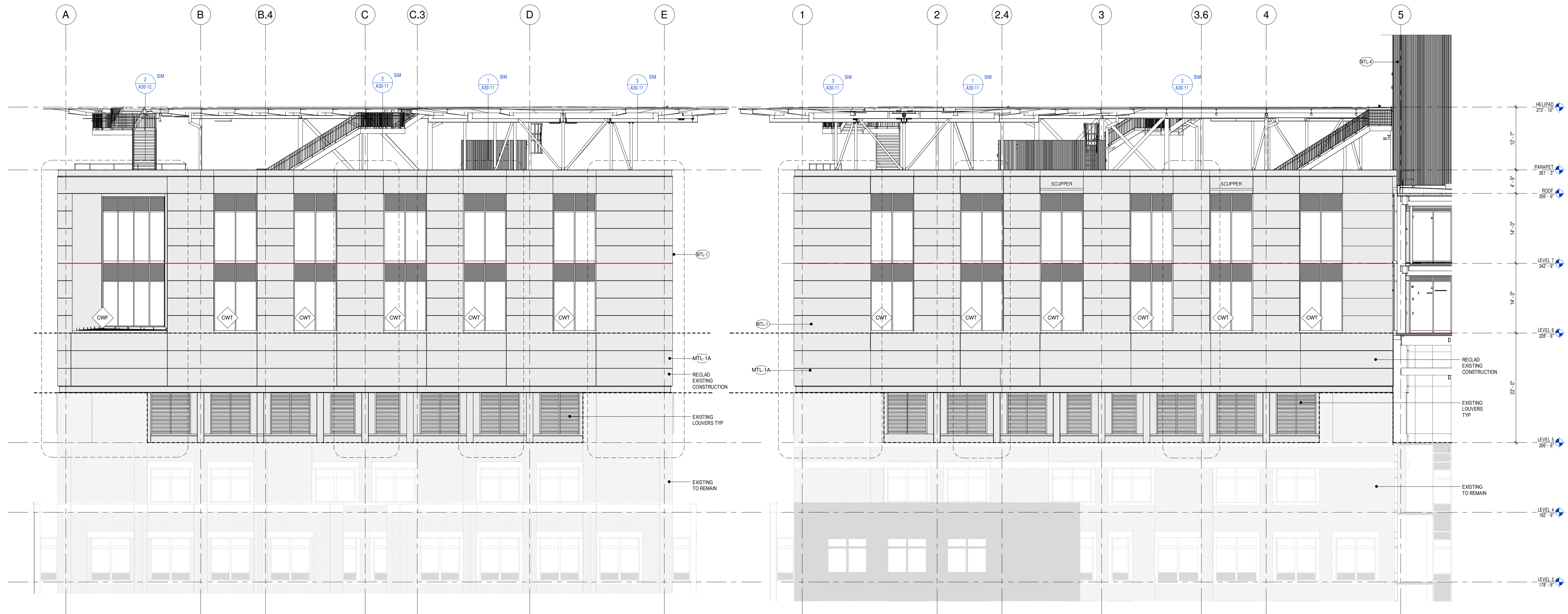
4 WEST ELEVATION - SECTOR 1 1/8" = 1'-0"