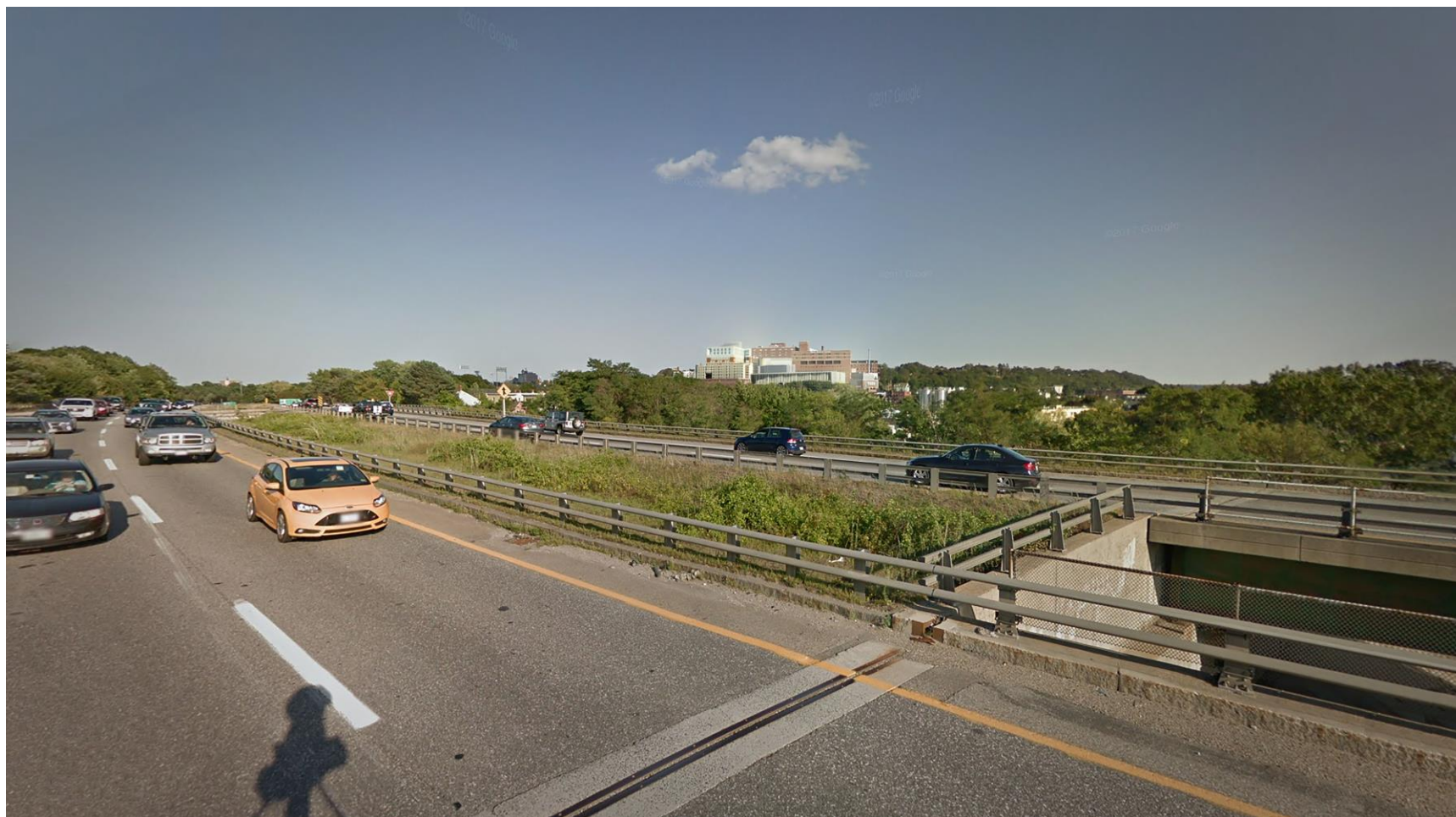
East Tower & Visitor Garage Overbuild As Seen from I-295 Date: 03/23/2018