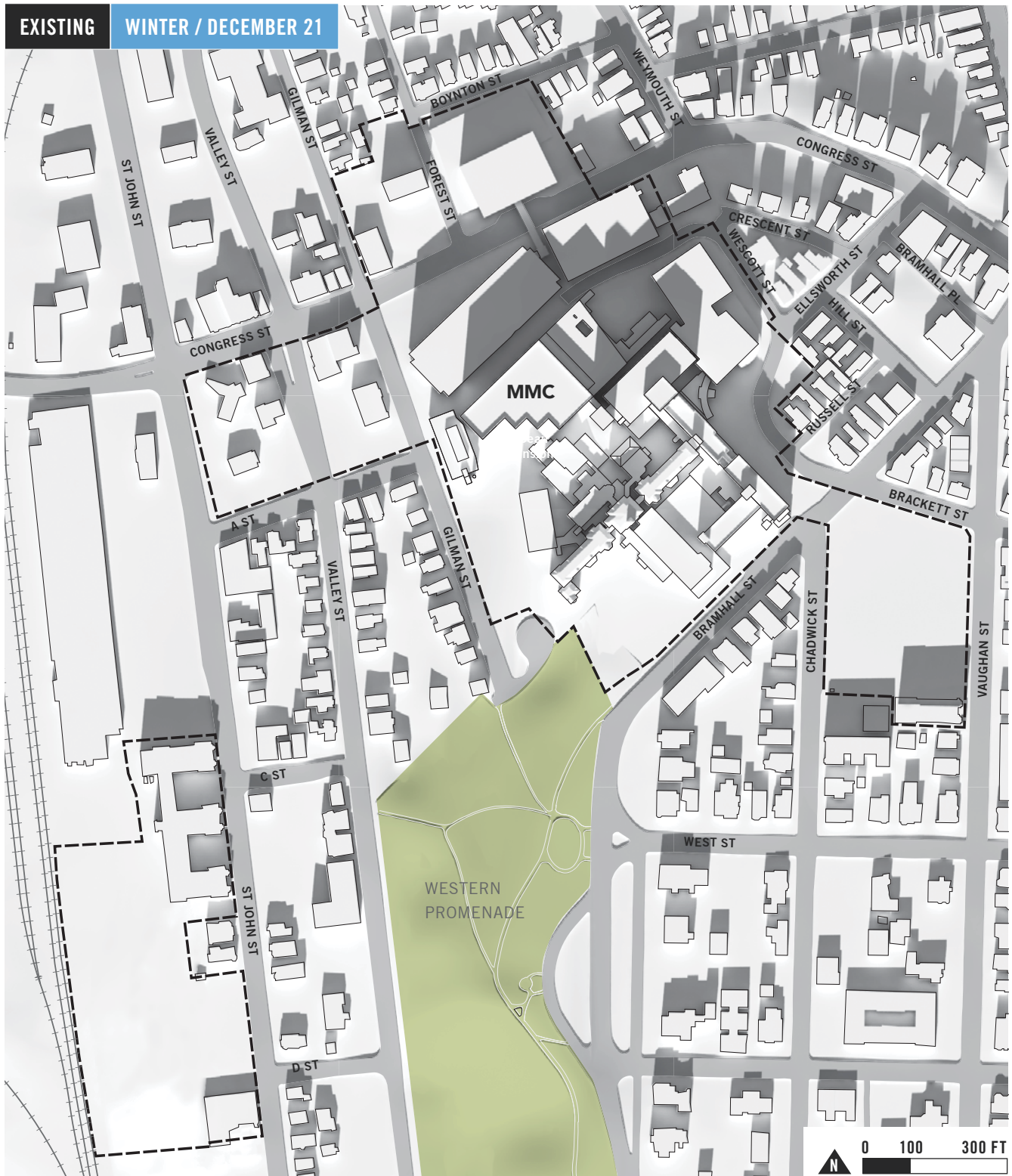
Fig.5.19 Computer-generated shadow study / Existing conditions on December 21, noon