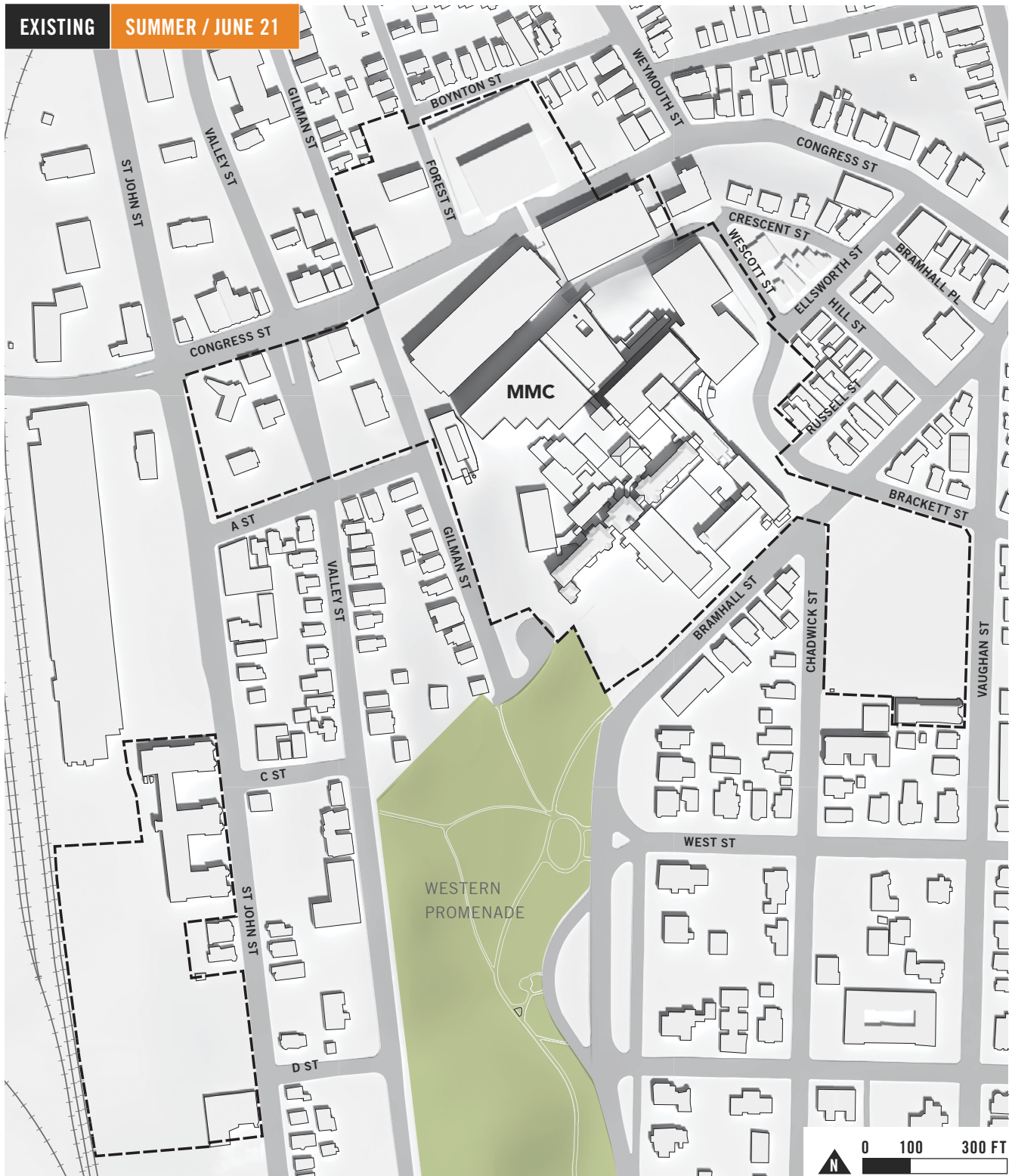
Fig.5.17 Computer-generated shadow study / Existing conditions on June 21, noon