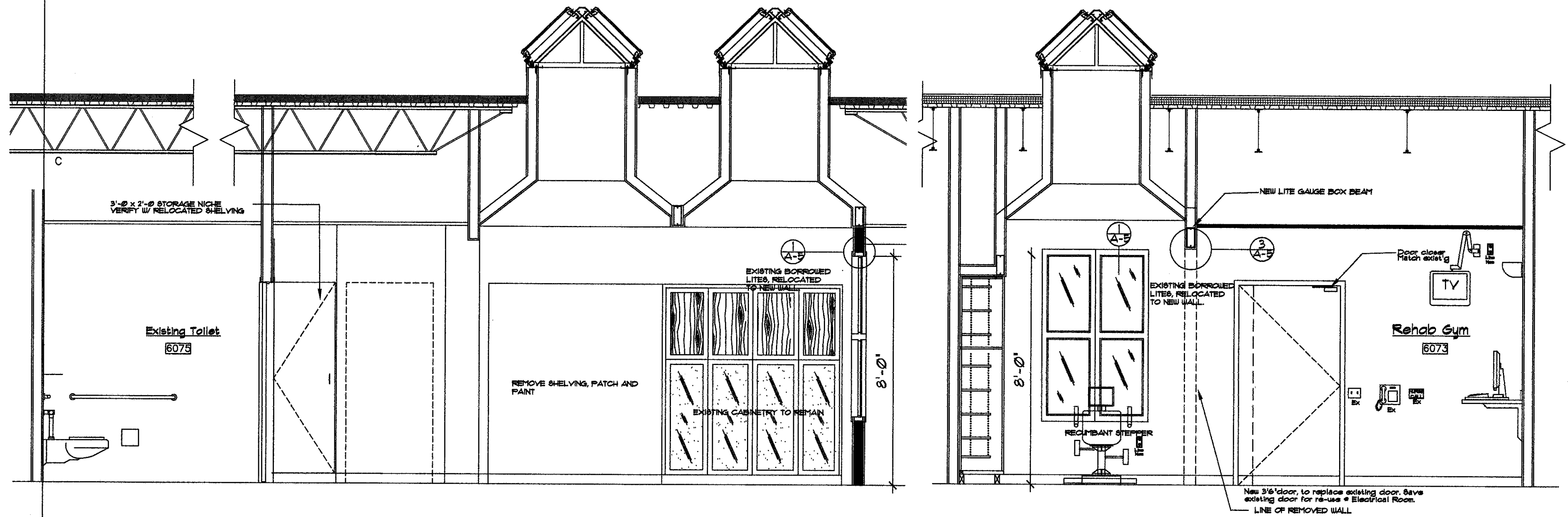
6 INTERIOR ELEVATION-new-@Rm 6073 SCALE: 3/8"=1'-0" Rehab Rm-New