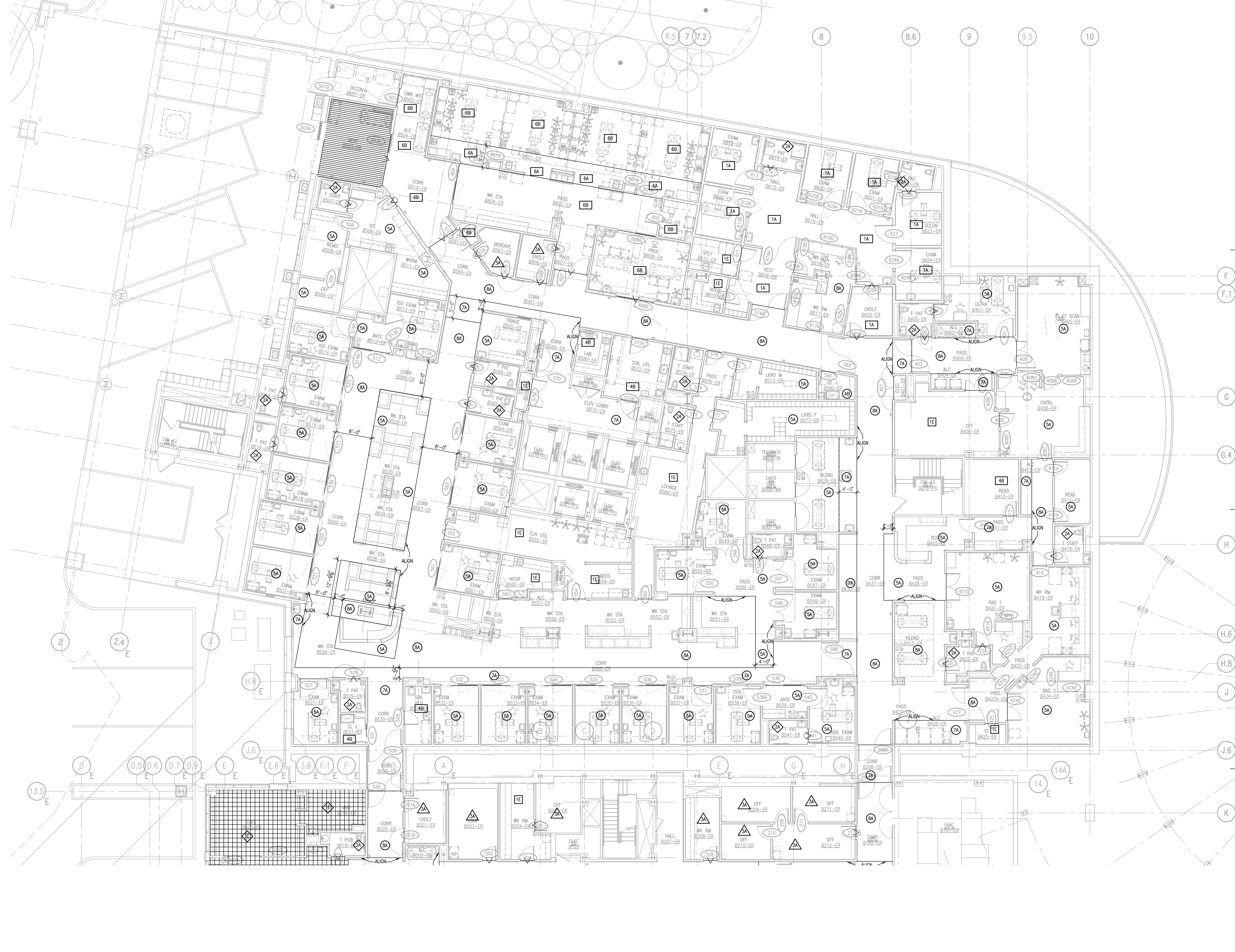
B5 SECTOR A FLOOR PLAN SCALE: 1/8" = 1'-0"